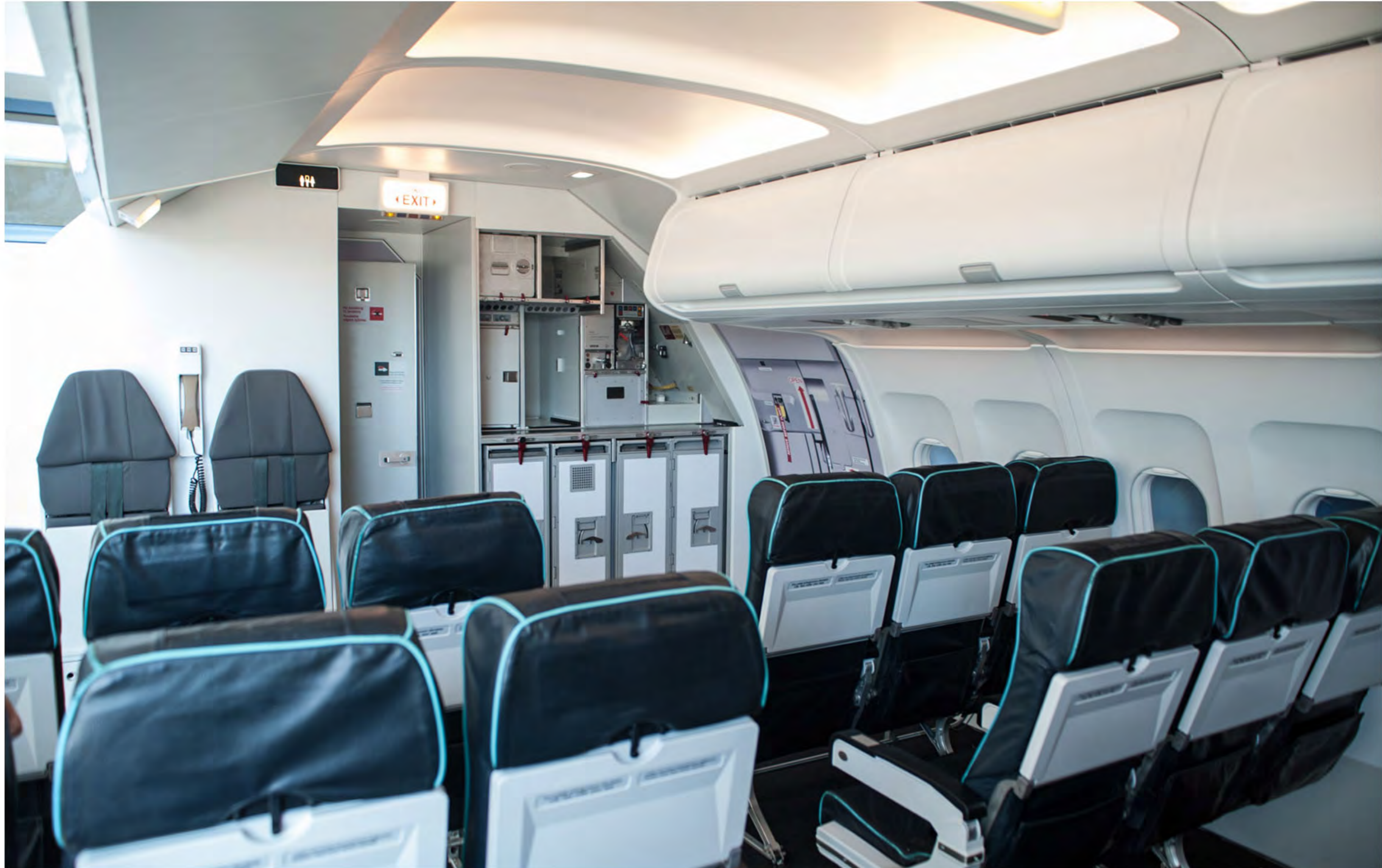
GEDIK UNIVERSITY AIRBUS 320 NARROW BODY CABIN SERVICE TRAINER