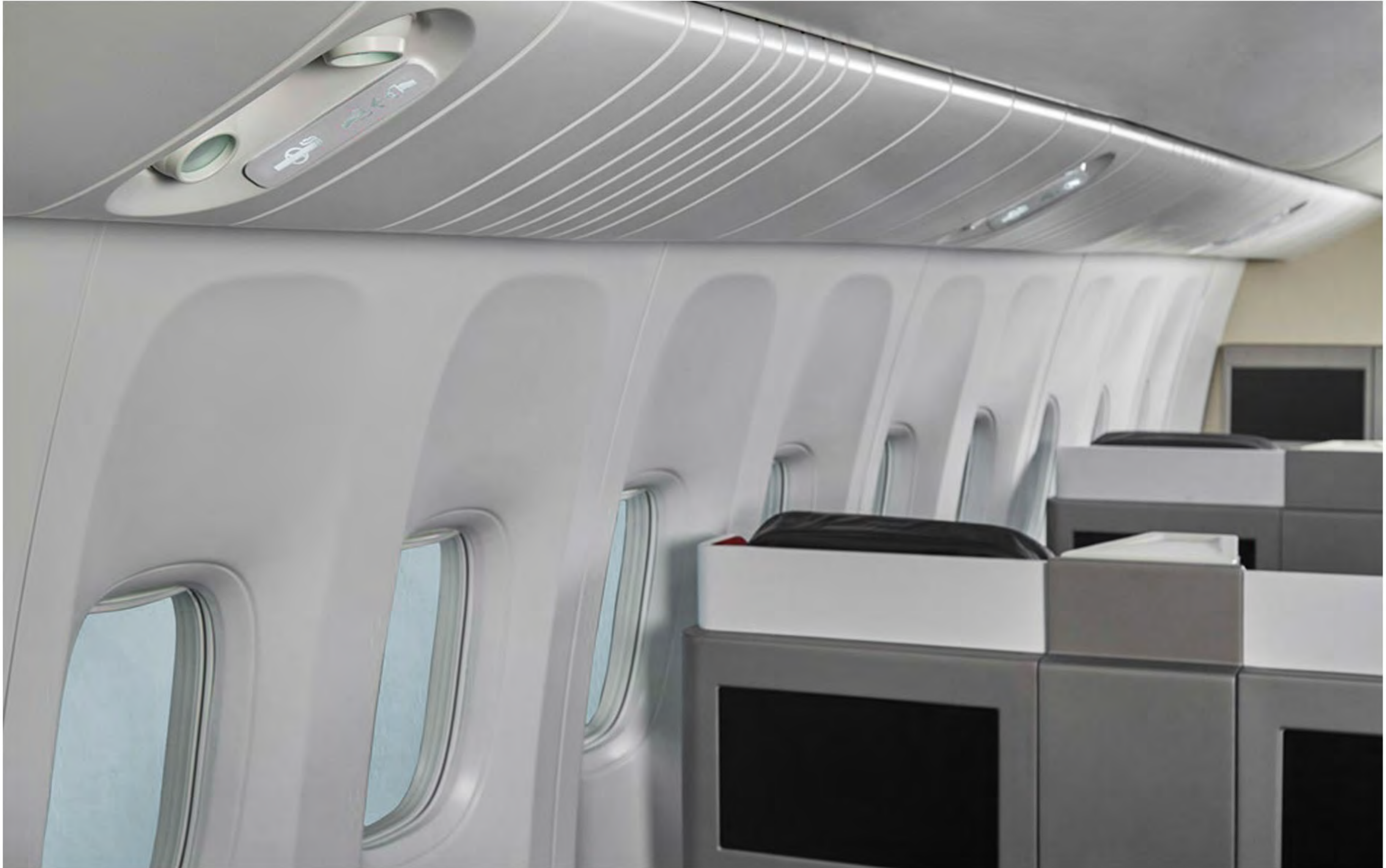
TURKISH AIRLINES BOEING 777 - 300ER MOCK - UP