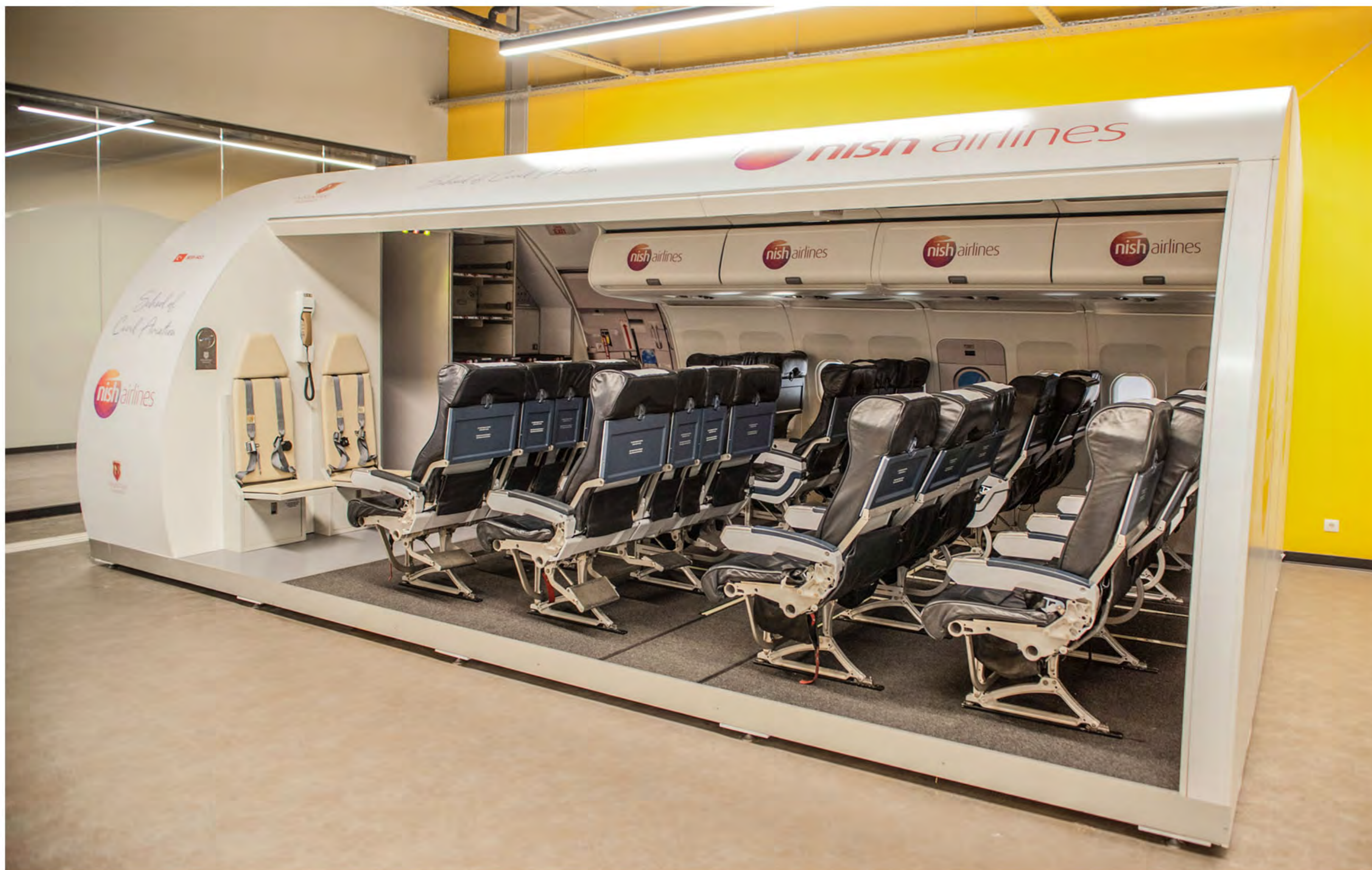
NISANTASI UNIVERSITY AIRBUS 320 NARROW BODY CABIN SERVICE TRAINER