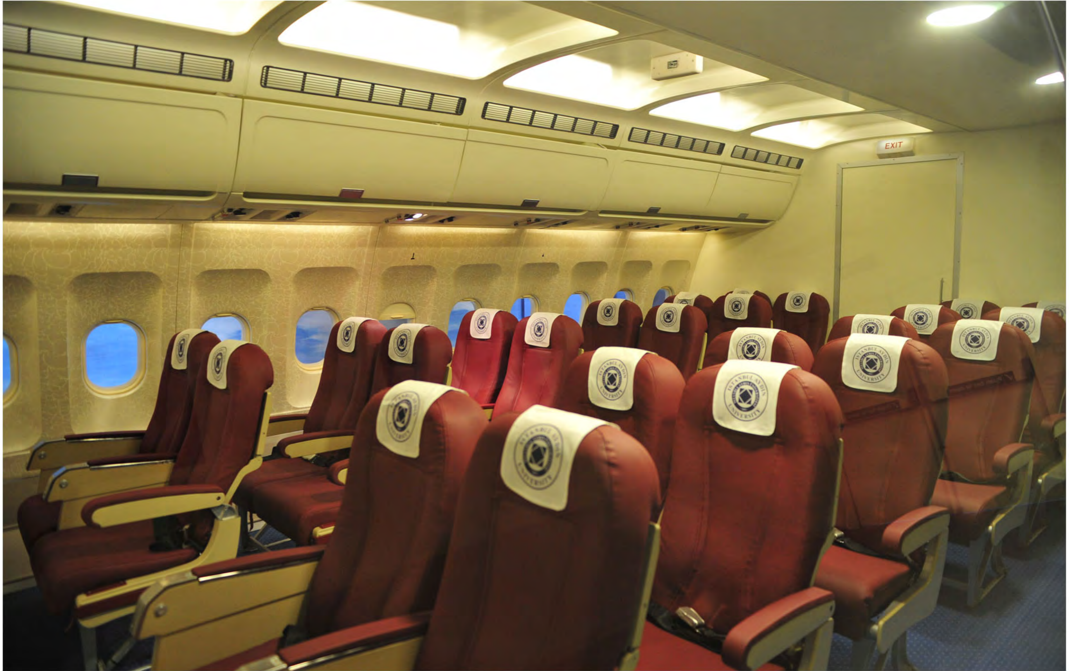
ISTANBUL AYDIN UNIVERSITY AIRBUS NARROW BODY CABIN SERVICE TRAINER