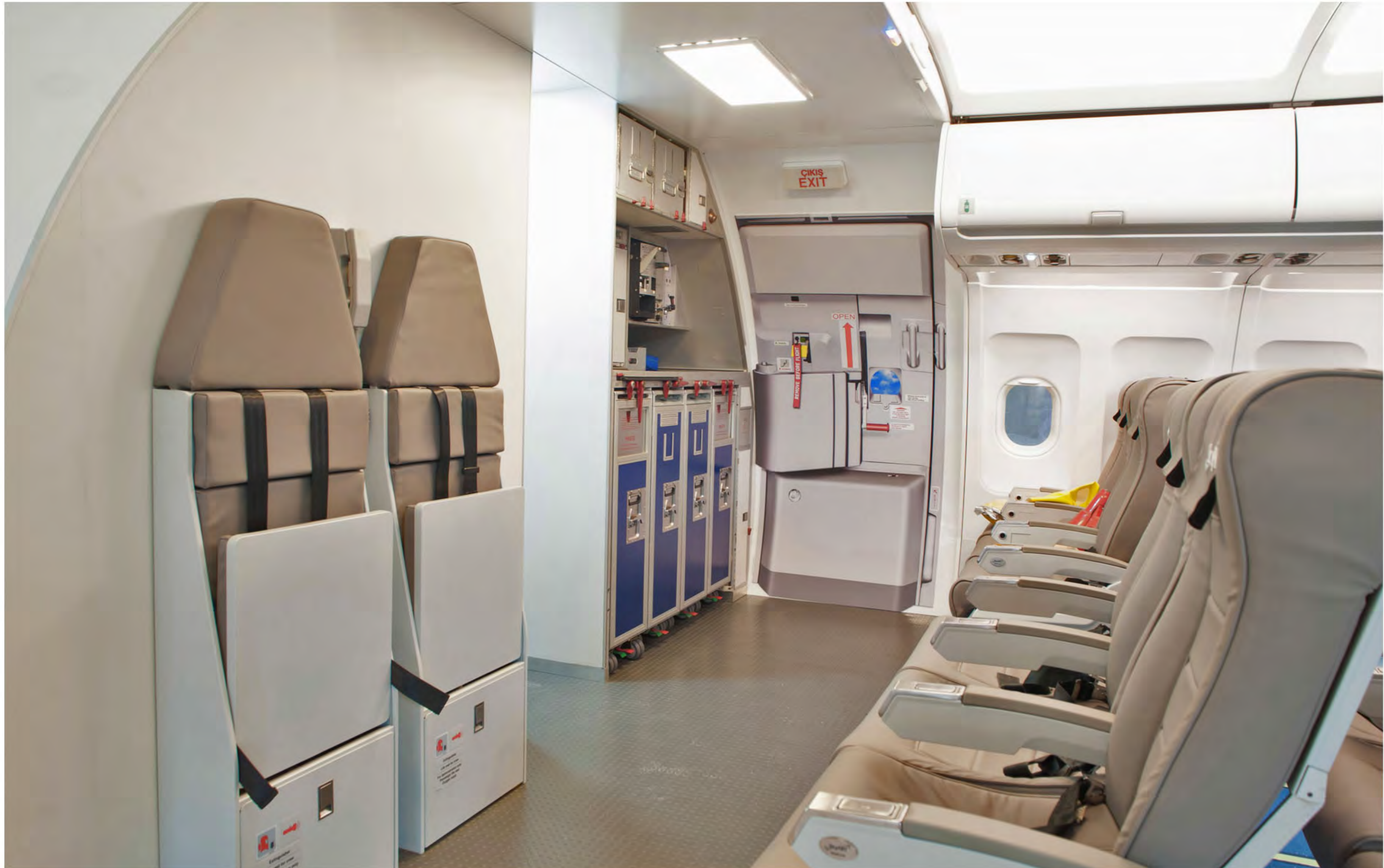
AIRBUS 320 NARROW BODY CABIN SERVICE TRAINER