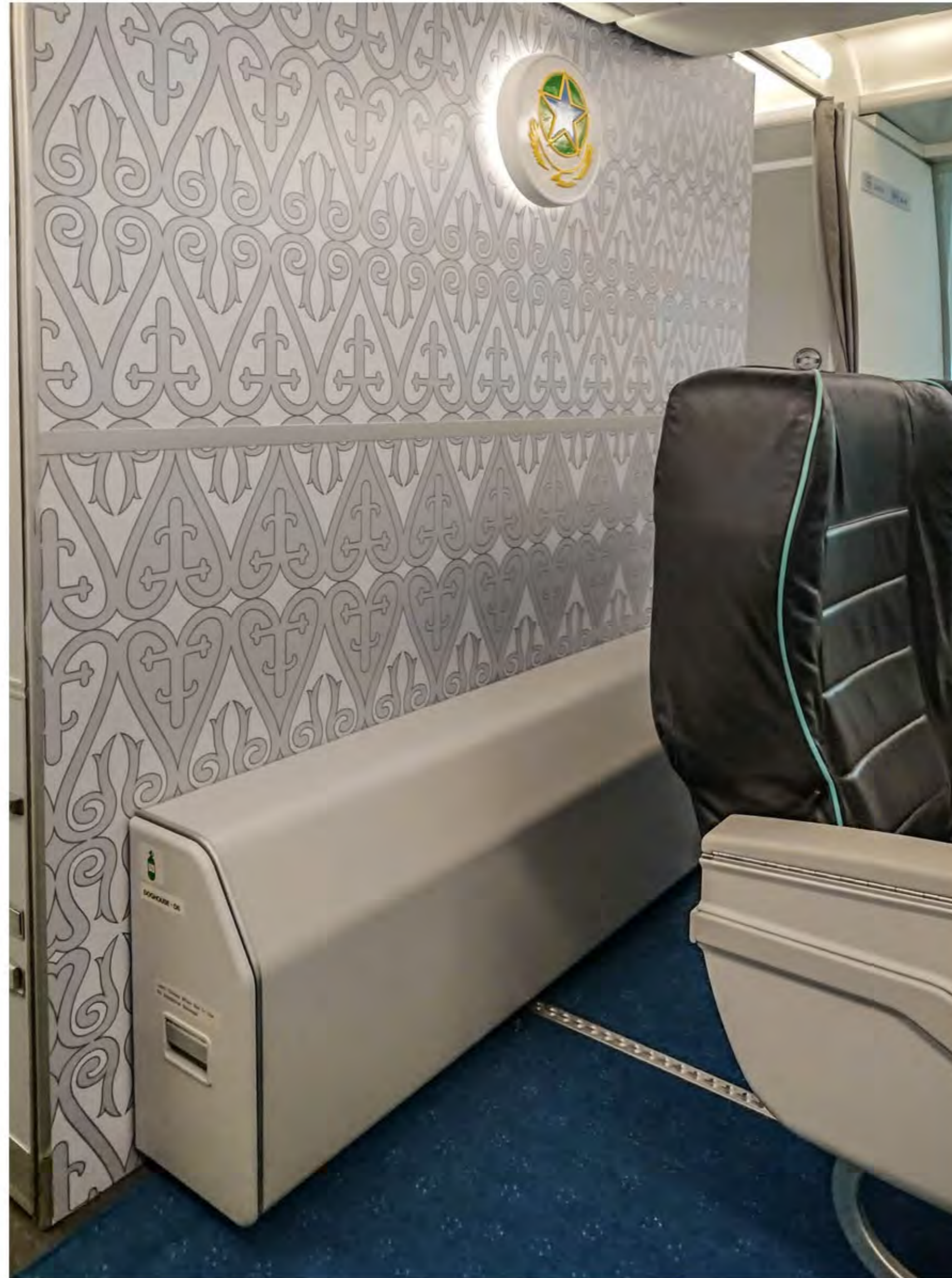
US DEPT. OF STATE & BORDER GUARD SERVICE OF THE REPUBLIC OF KAZAKHSTAN BOEING 777 WIDE BODY TRAINER