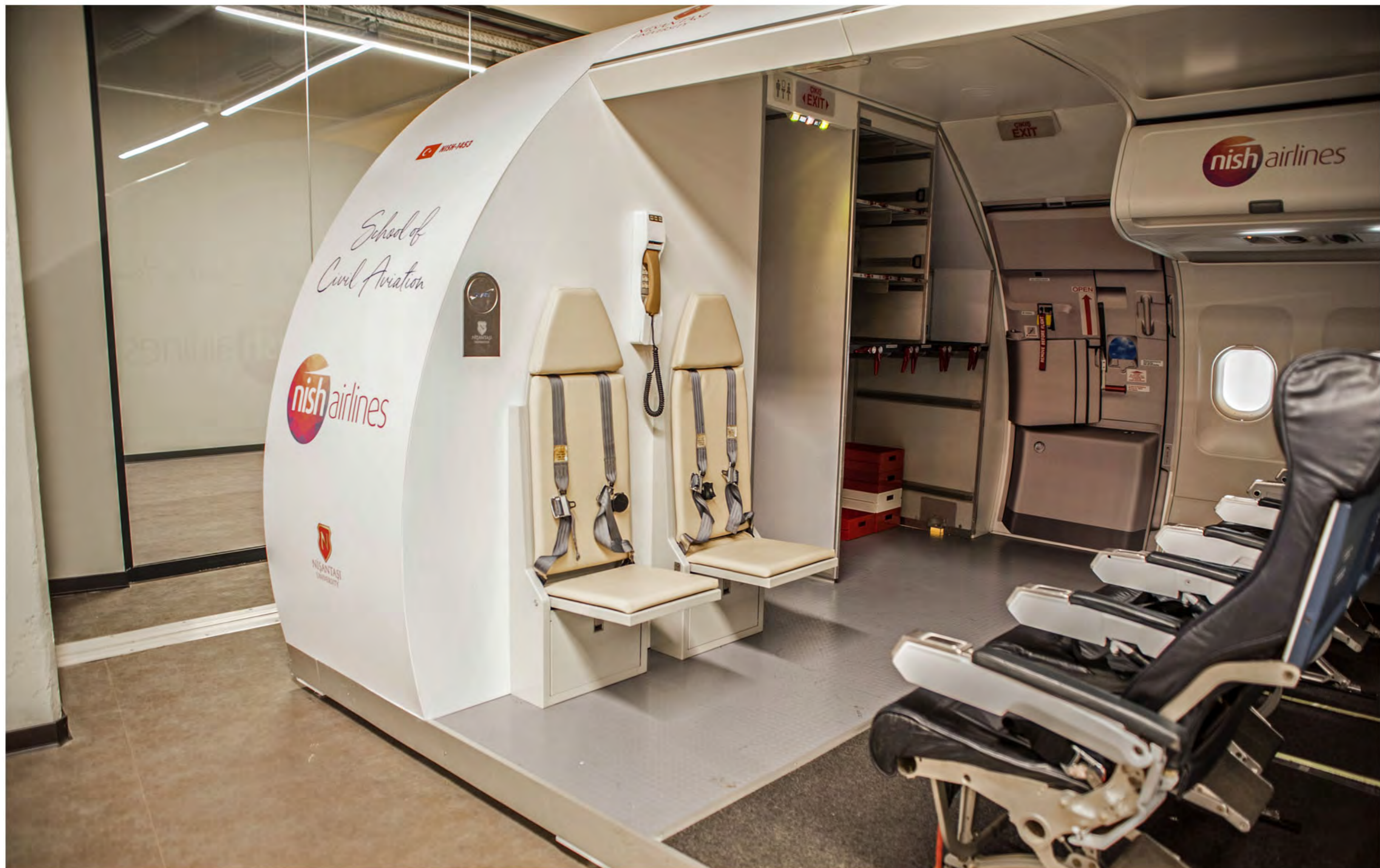
NISANTASI UNIVERSITY AIRBUS 320 NARROW BODY CABIN SERVICE TRAINER