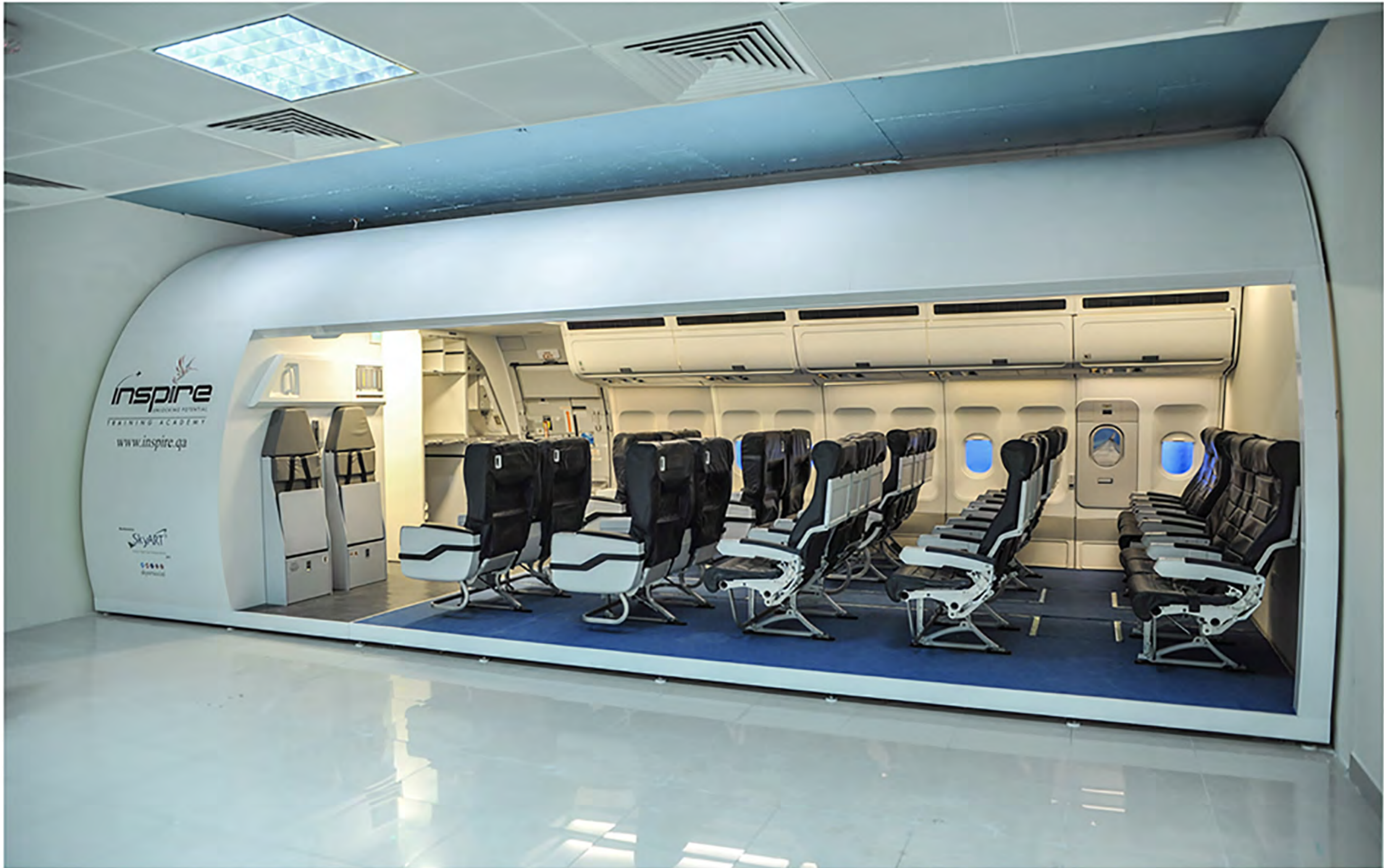
INSPIRE TRAINING ACADEMY AIRBUS NARROW BODY CABIN SERVICE TRAINER