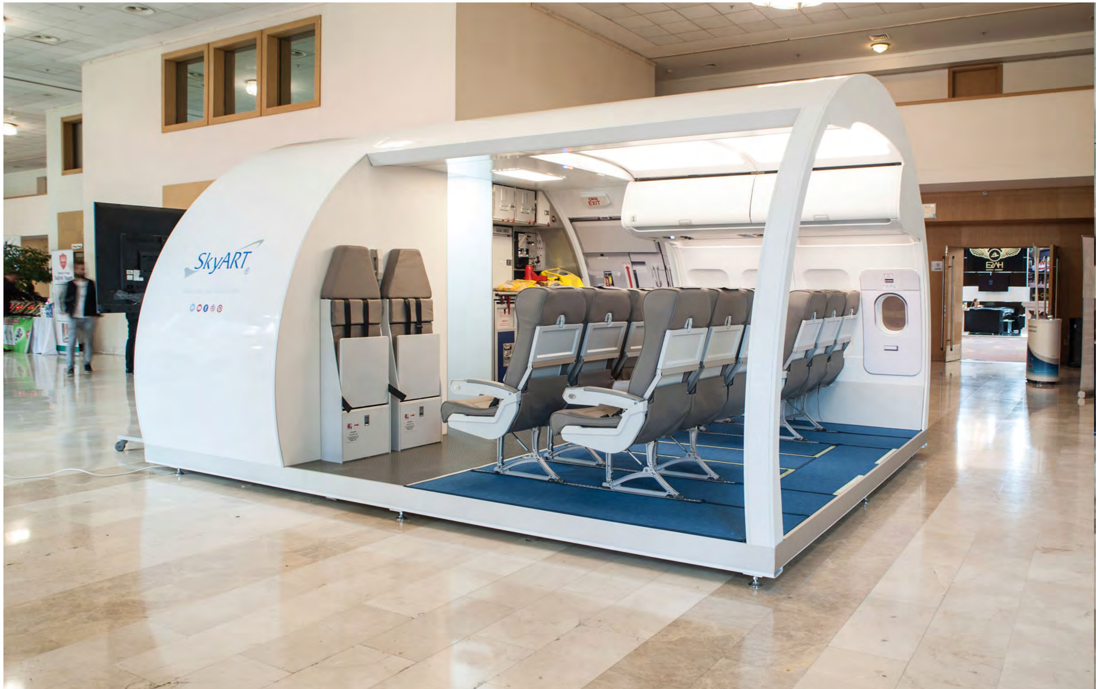
AIRBUS 320 NARROW BODY CABIN SERVICE TRAINER