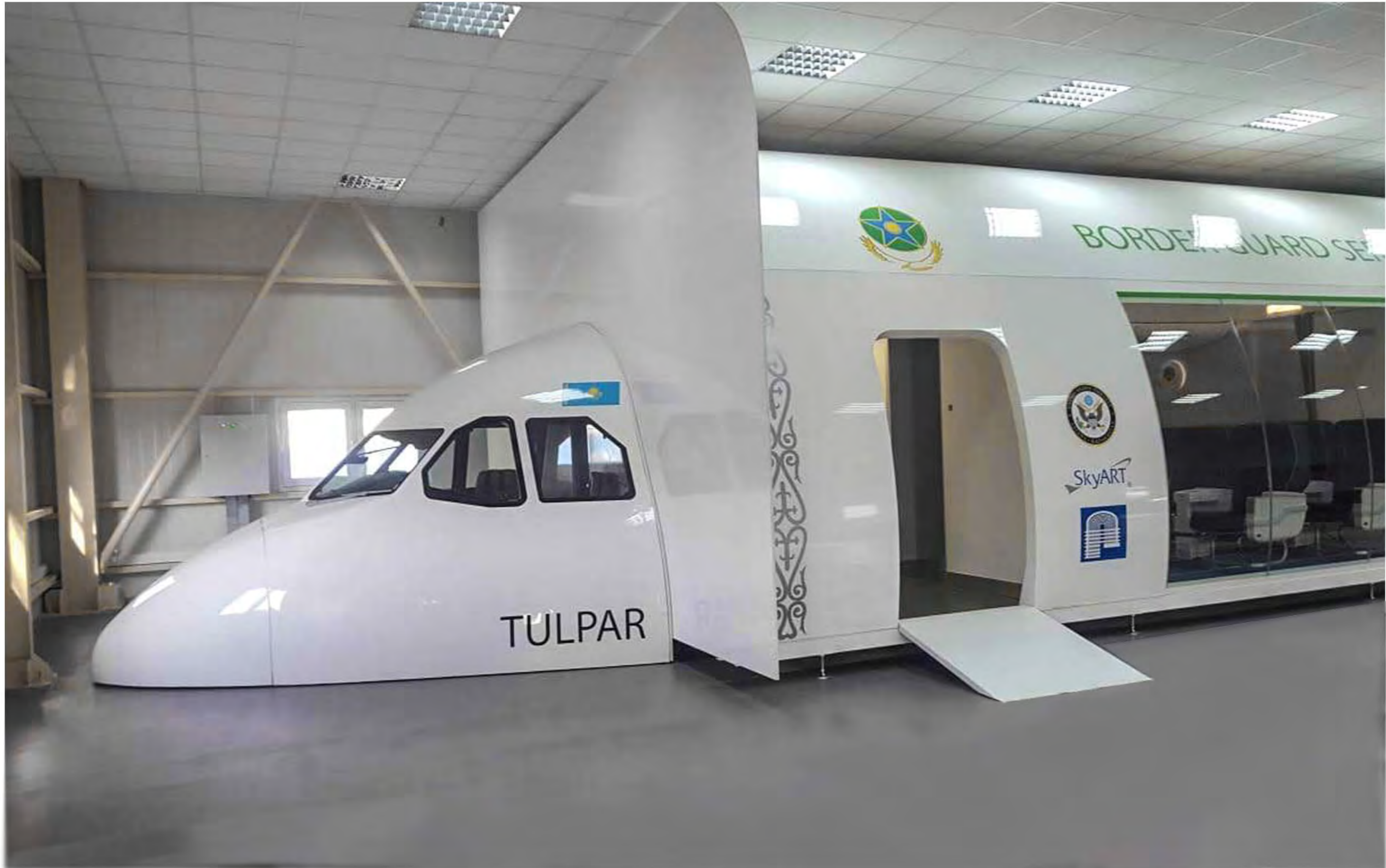
US DEPT. OF STATE & BORDER GUARD SERVICE OF THE REPUBLIC OF KAZAKHSTAN BOEING 777 WIDE BODY TRAINER