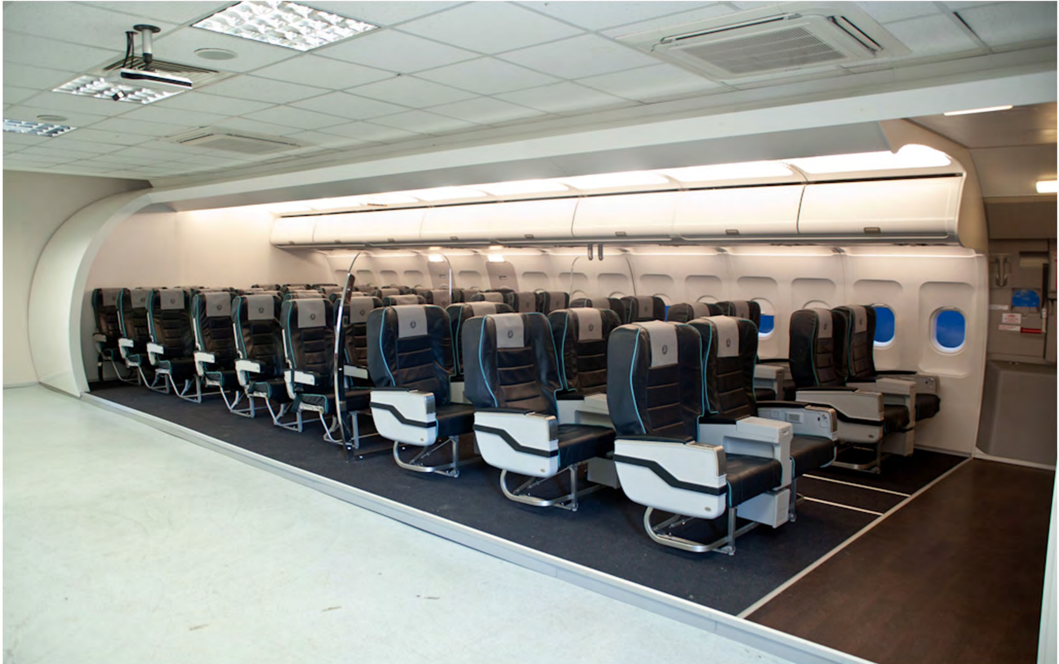
FSM UNIVERSITY AIRBUS 320 NARROW BODY CABIN SERVICE TRAINER