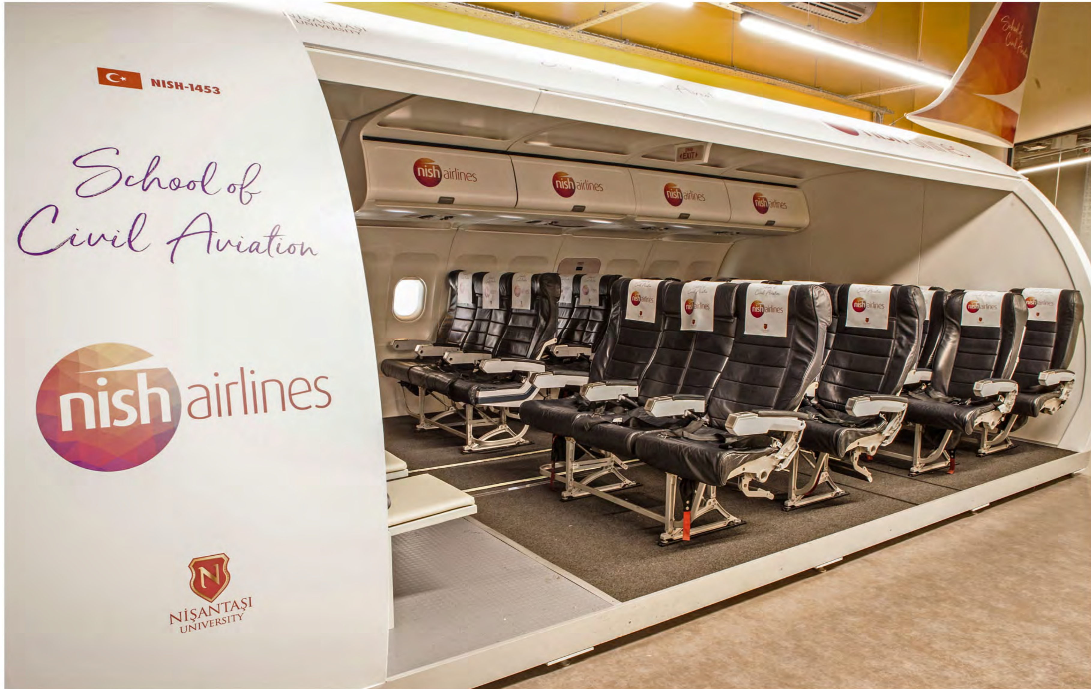
NISANTASI UNIVERSITY AIRBUS 320 NARROW BODY CABIN SERVICE TRAINER