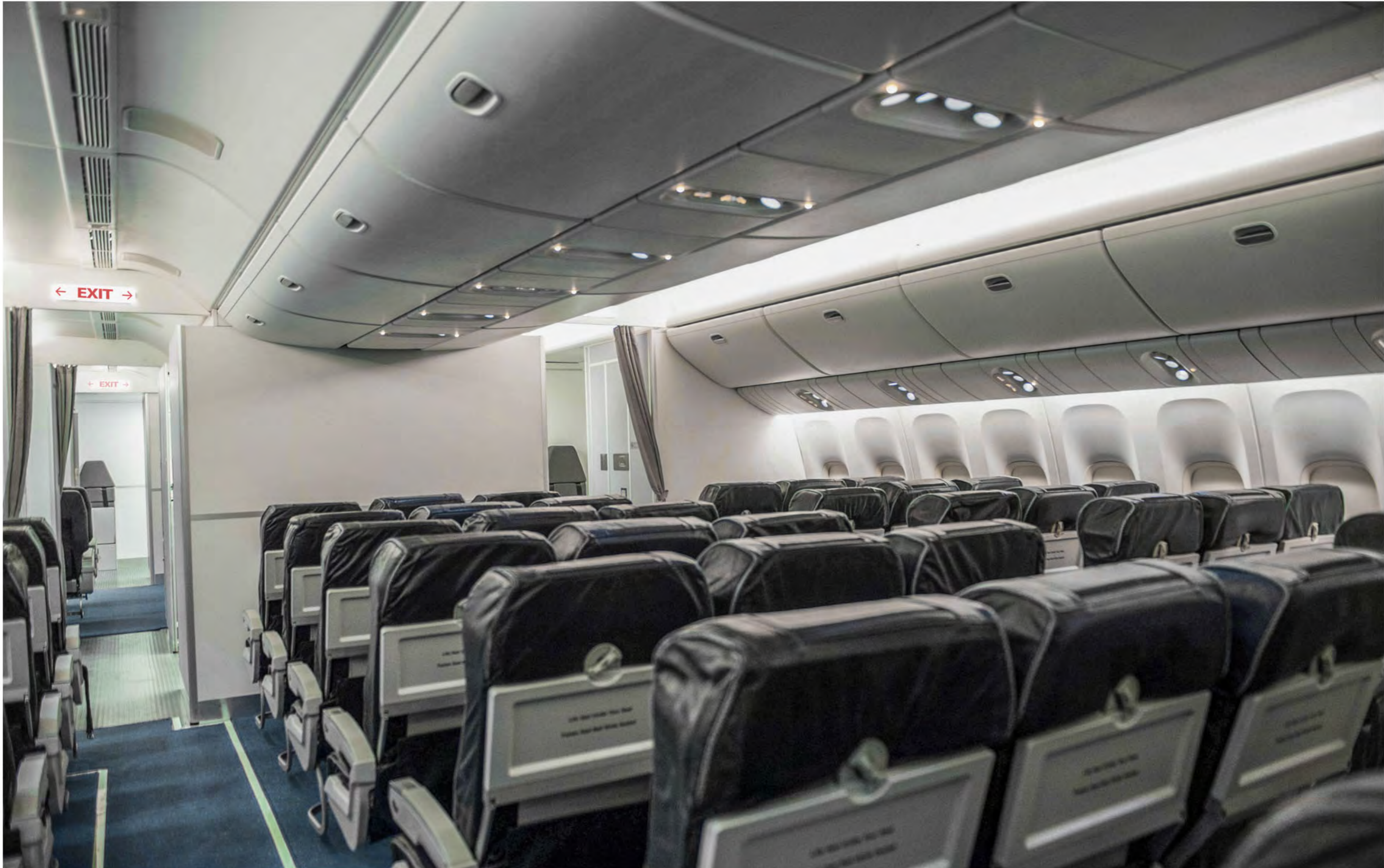
US DEPT. OF STATE & BORDER GUARD SERVICE OF THE REPUBLIC OF KAZAKHSTAN BOEING 777 WIDE BODY TRAINER