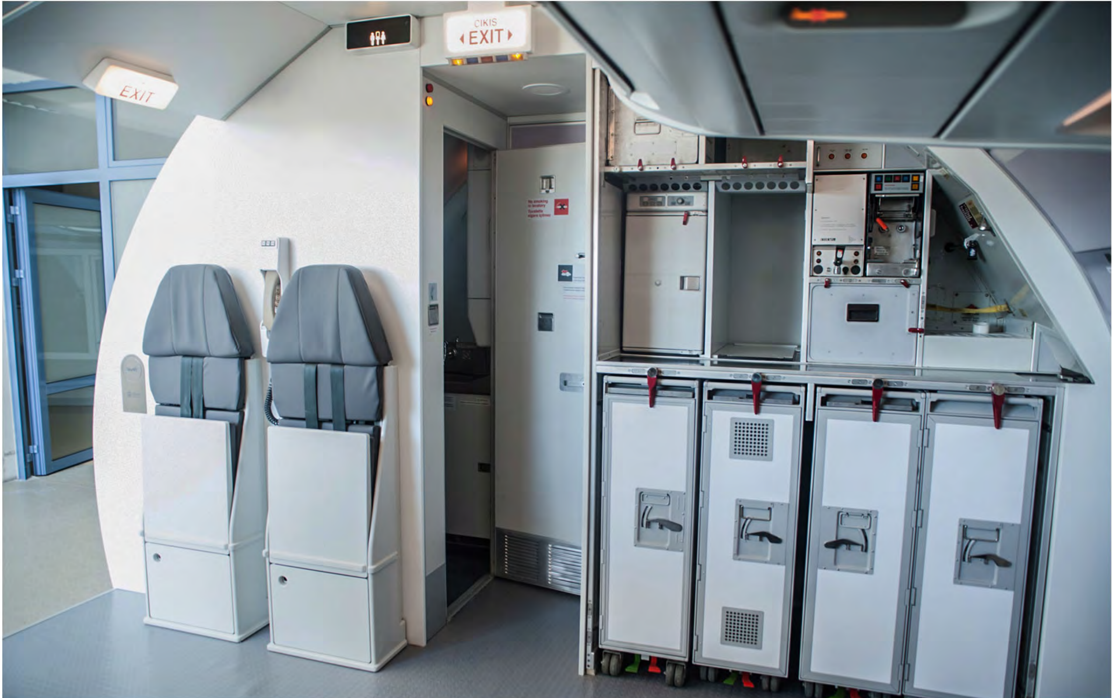
GEDIK UNIVERSITY AIRBUS 320 NARROW BODY CABIN SERVICE TRAINER