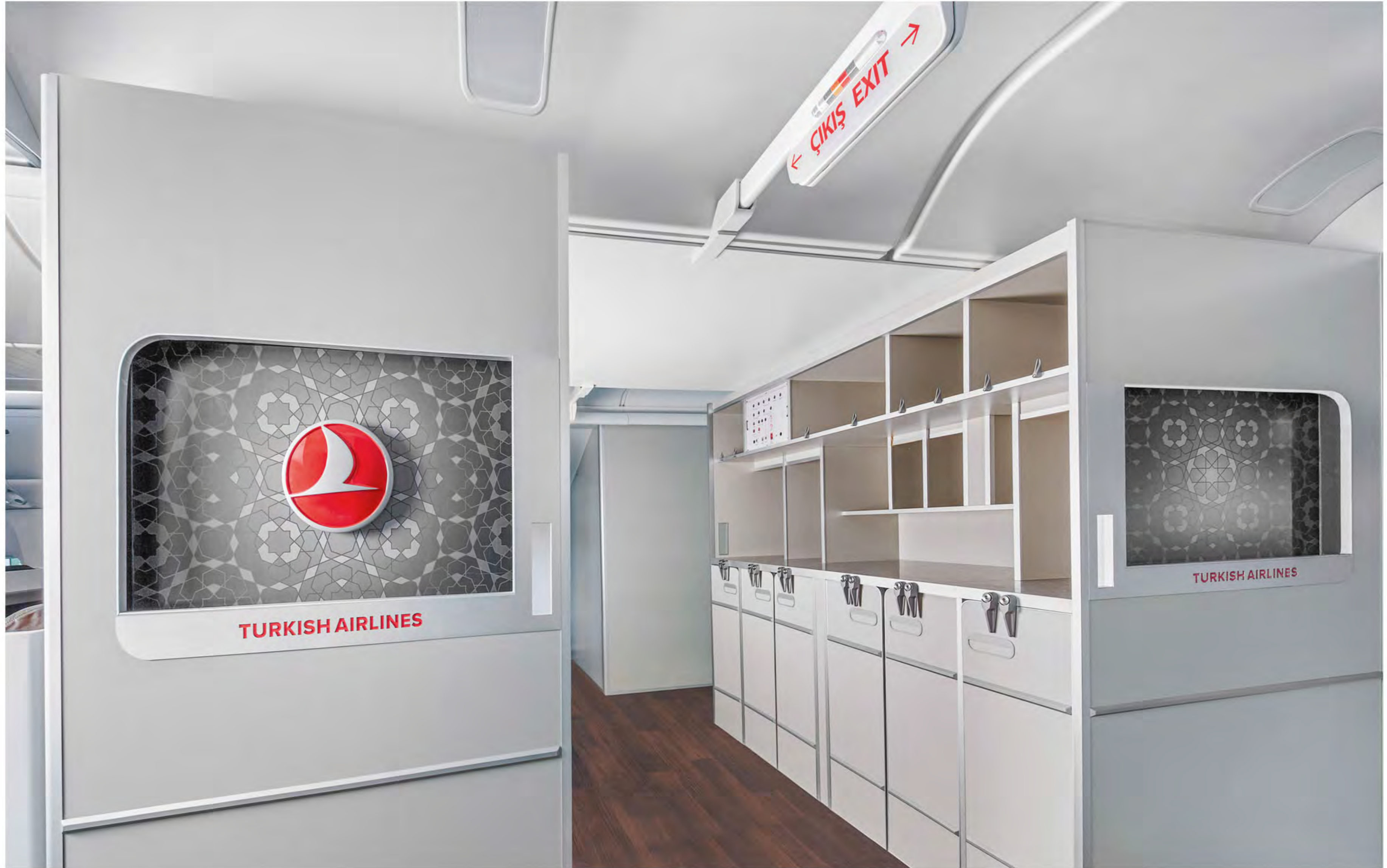
TURKISH AIRLINES BOEING 777 - 300ER MOCK - UP