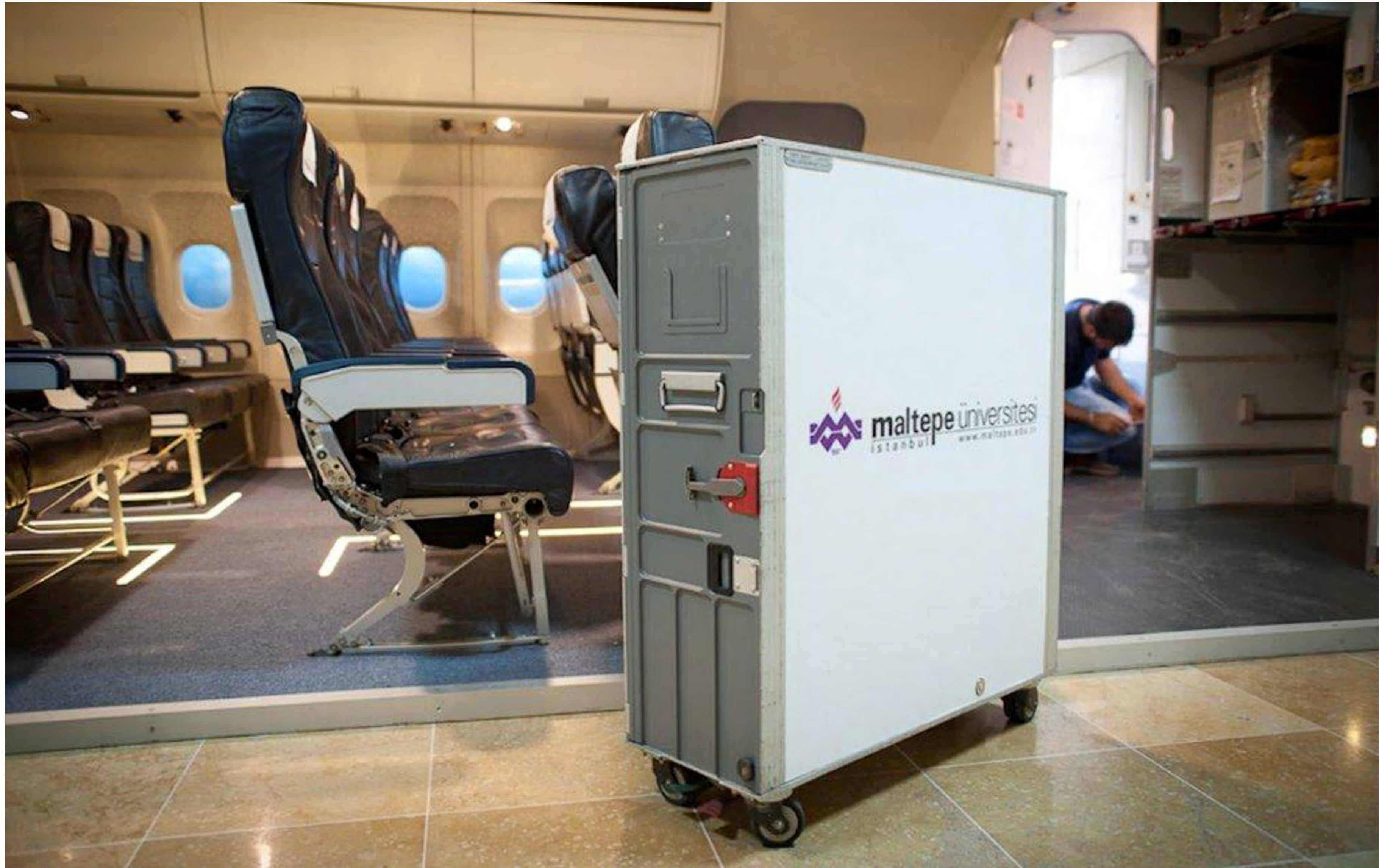
MALTEPE UNIVERSITY AIRBUS NARROW BODY CABIN SERVICE TRAINER