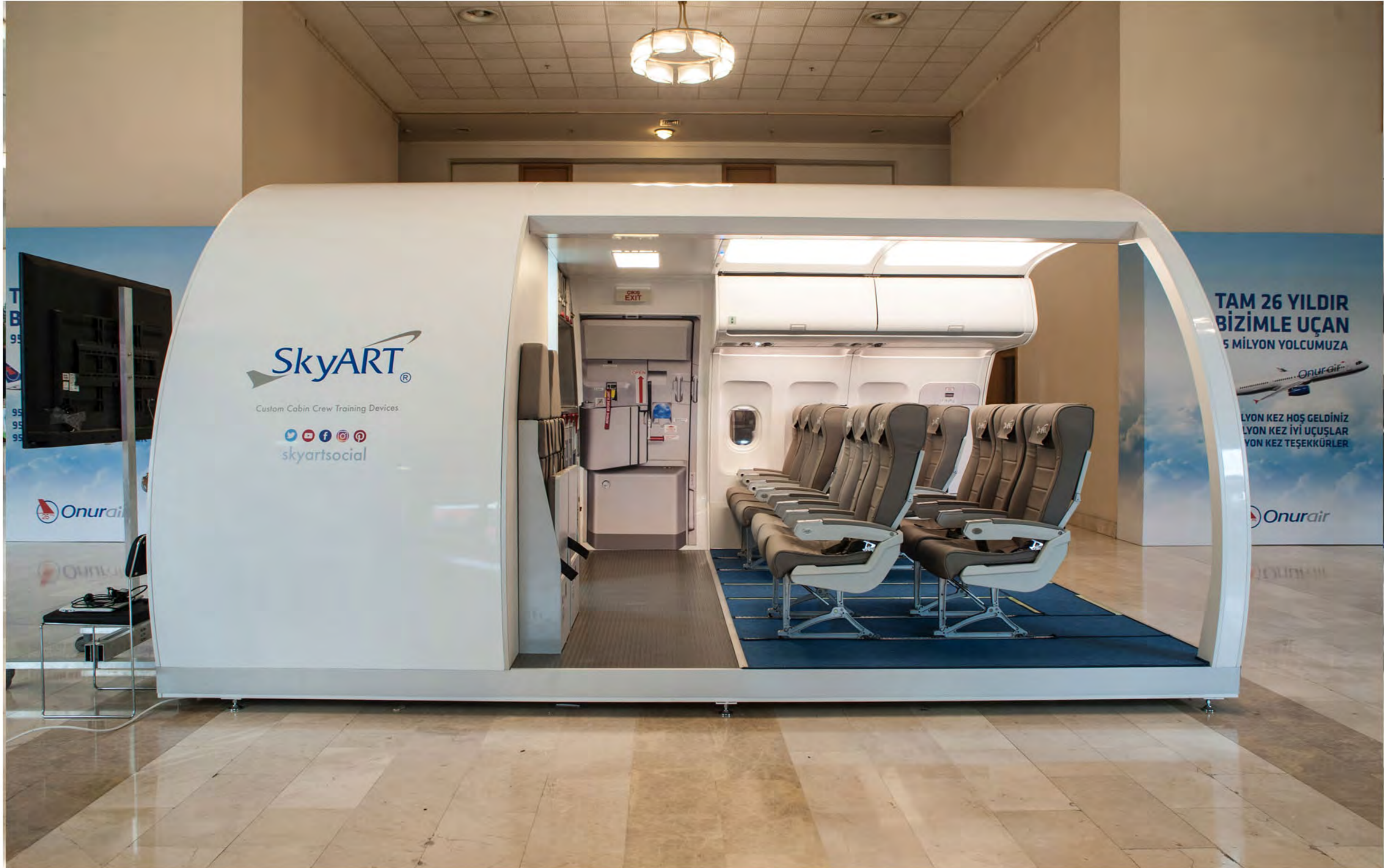
AIRBUS 320 NARROW BODY CABIN SERVICE TRAINER