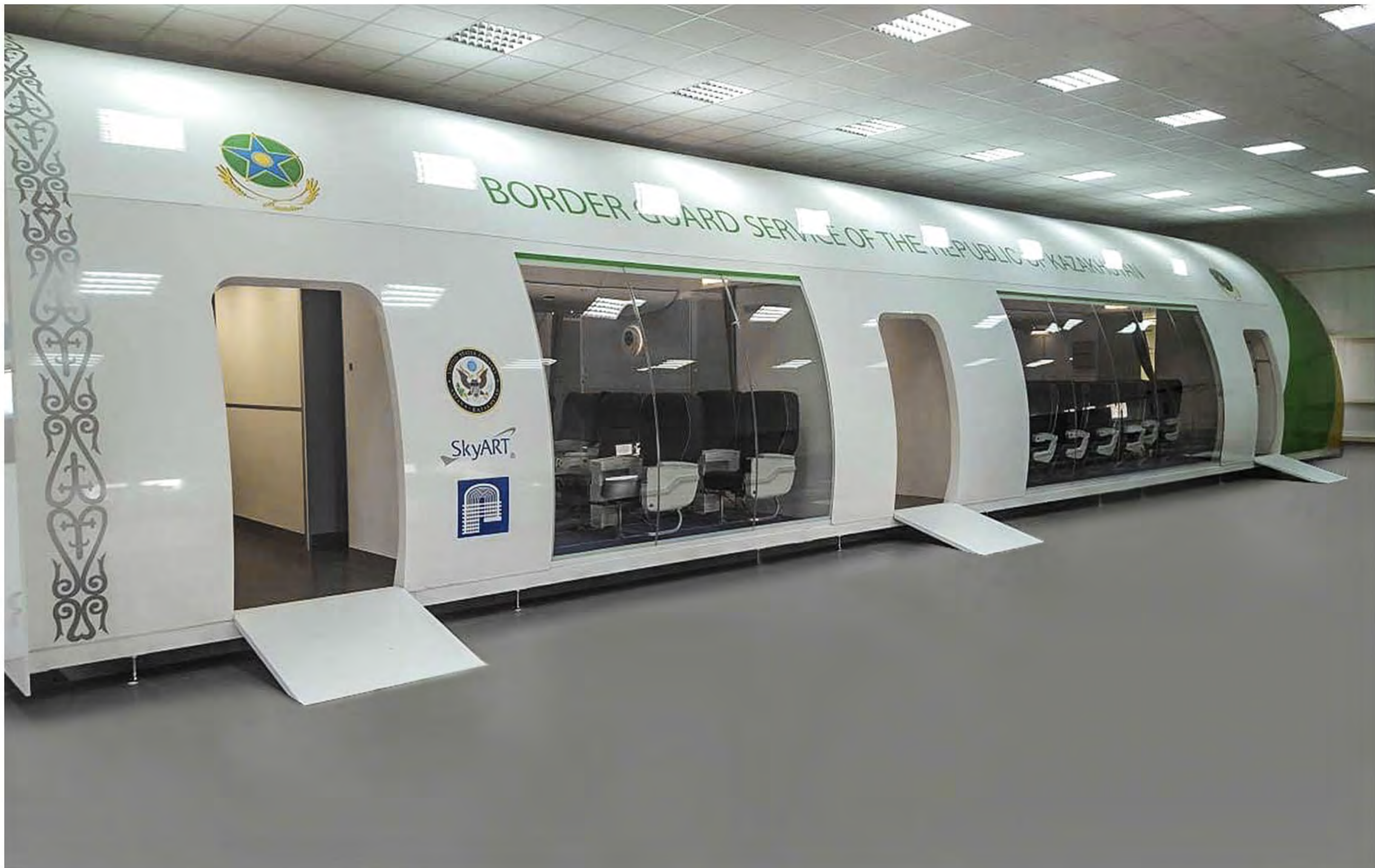
US DEPT. OF STATE & BORDER GUARD SERVICE OF THE REPUBLIC OF KAZAKHSTAN BOEING 777 WIDE BODY TRAINER