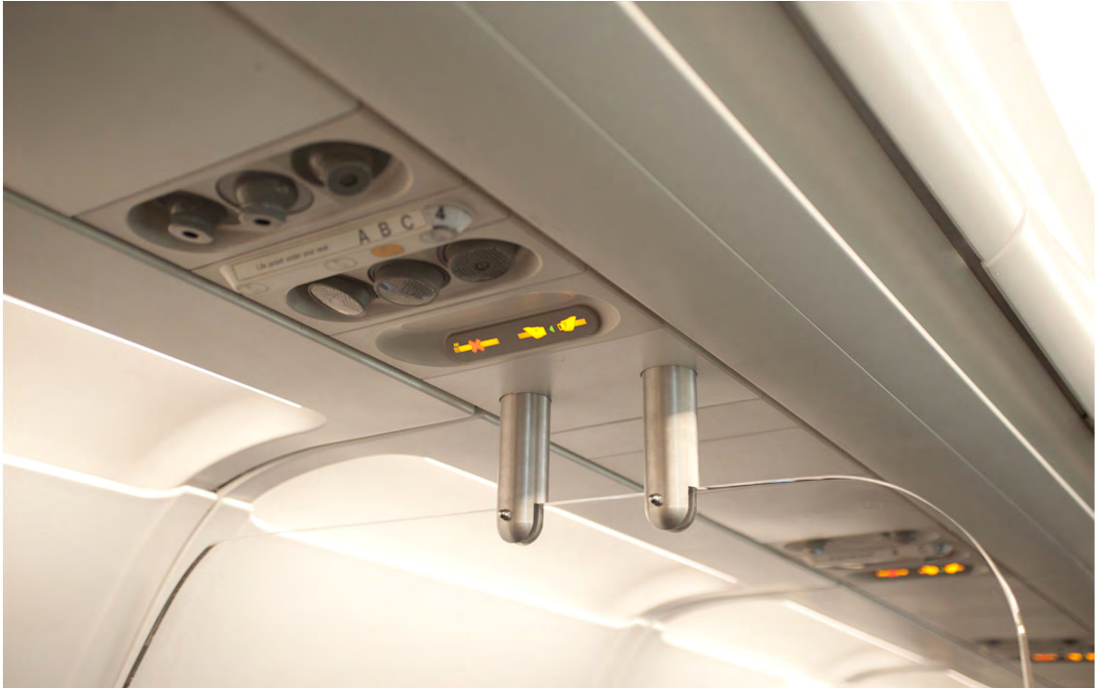
FSM UNIVERSITY AIRBUS 320 NARROW BODY CABIN SERVICE TRAINER