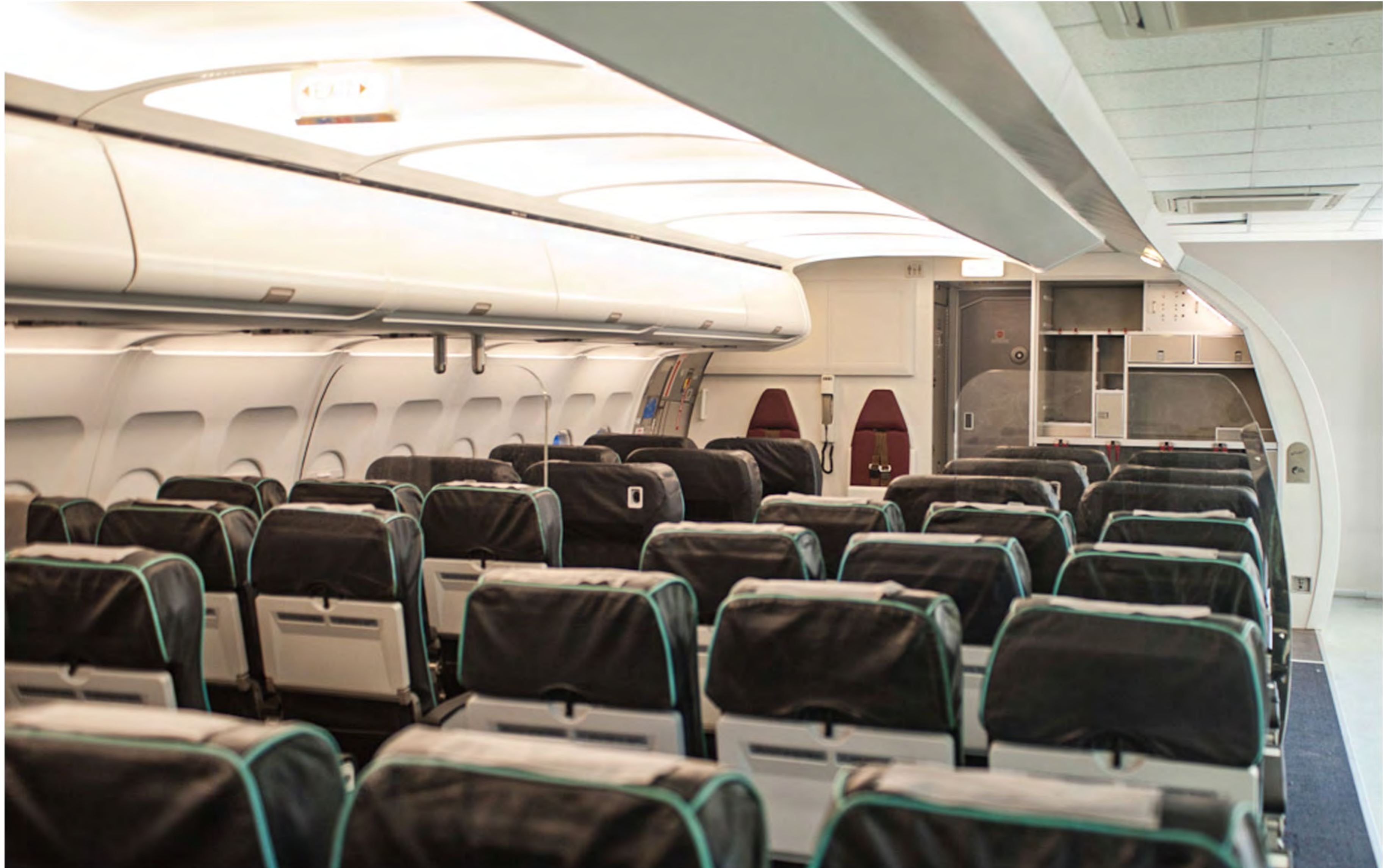
FSM UNIVERSITY AIRBUS 320 NARROW BODY CABIN SERVICE TRAINER