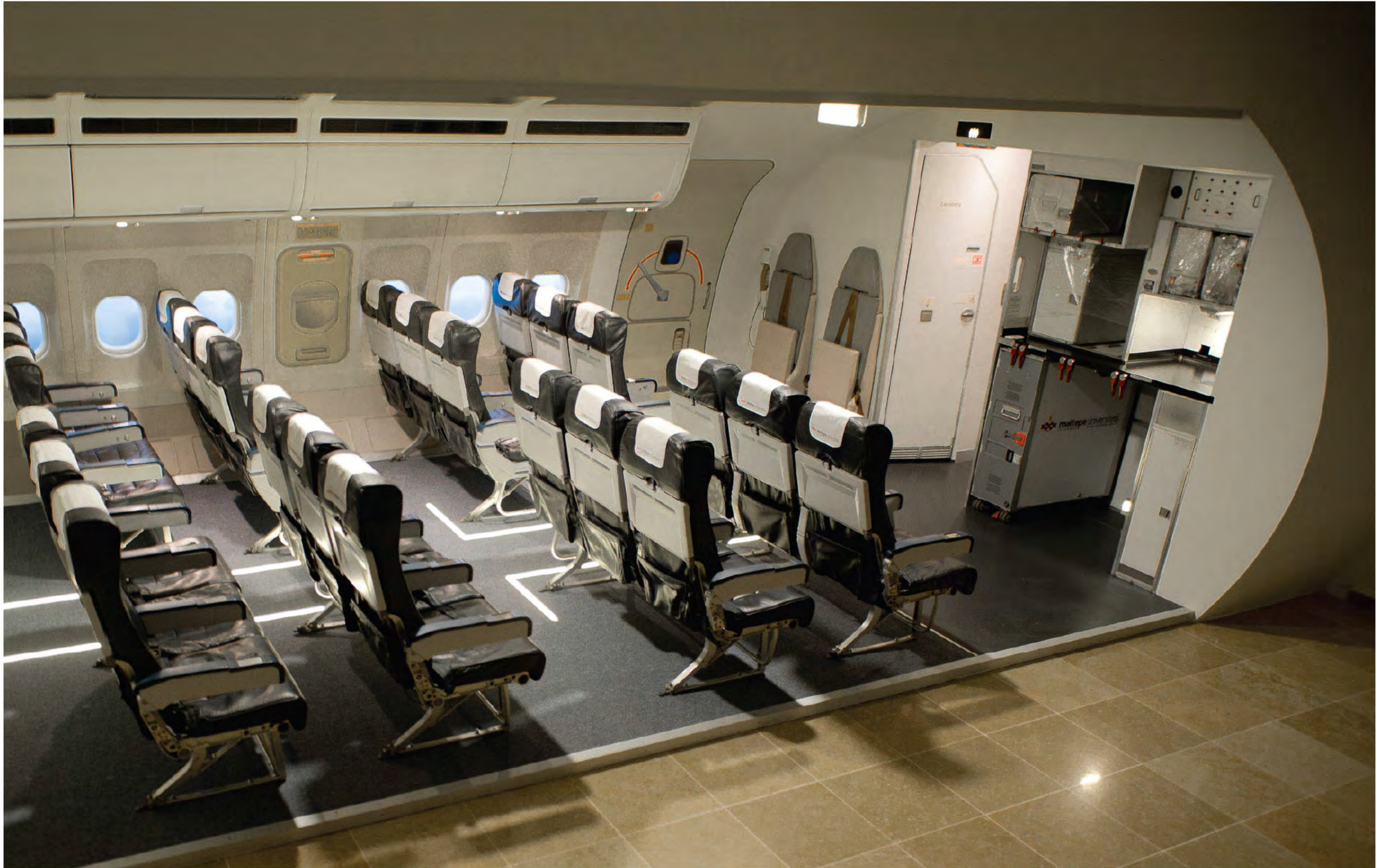
MALTEPE UNIVERSITY AIRBUS NARROW BODY CABIN SERVICE TRAINER