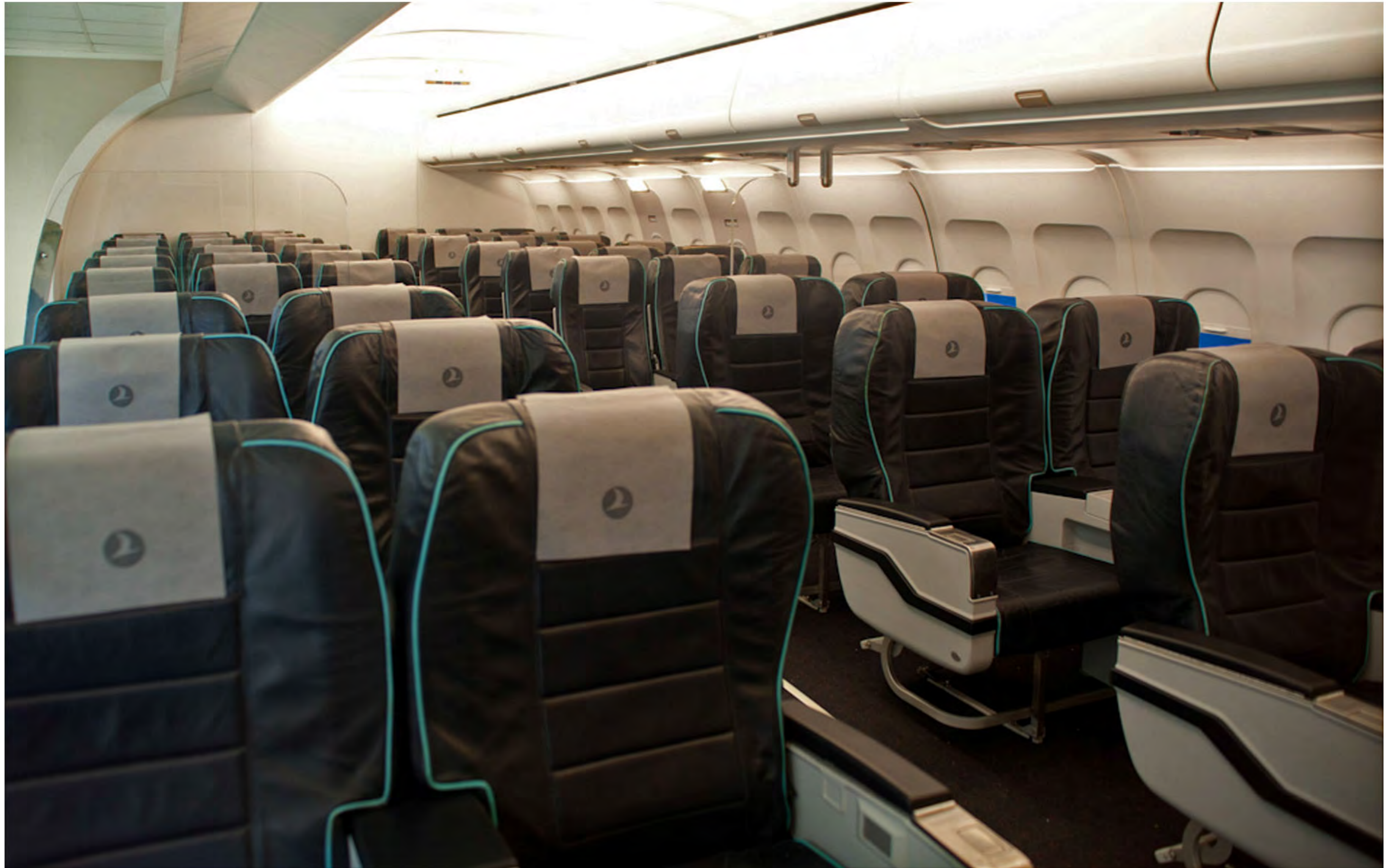
FSM UNIVERSITY AIRBUS 320 NARROW BODY CABIN SERVICE TRAINER