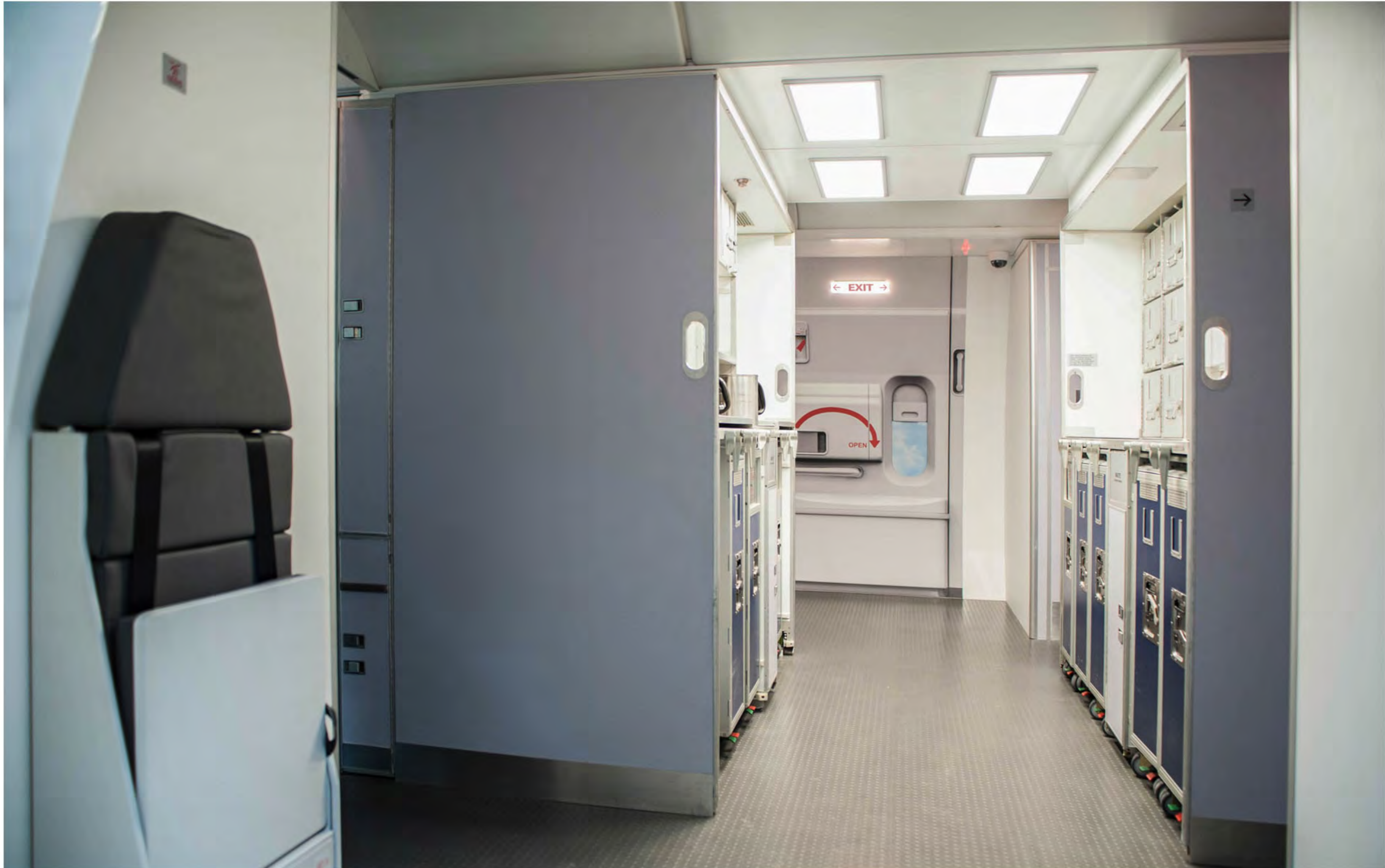
US DEPT. OF STATE & BORDER GUARD SERVICE OF THE REPUBLIC OF KAZAKHSTAN BOEING 777 WIDE BODY TRAINER