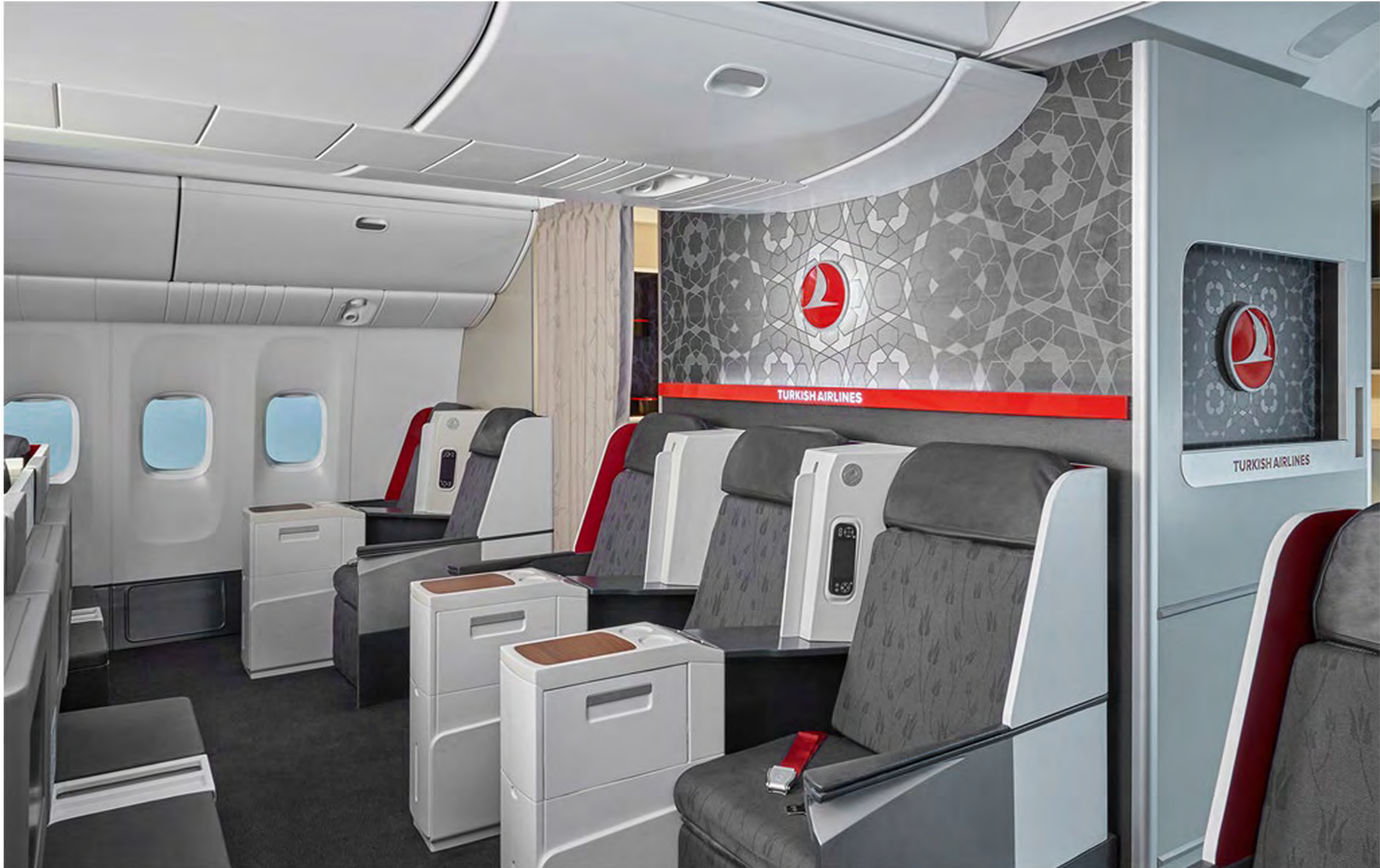
TURKISH AIRLINES BOEING 777 - 300ER MOCK - UP