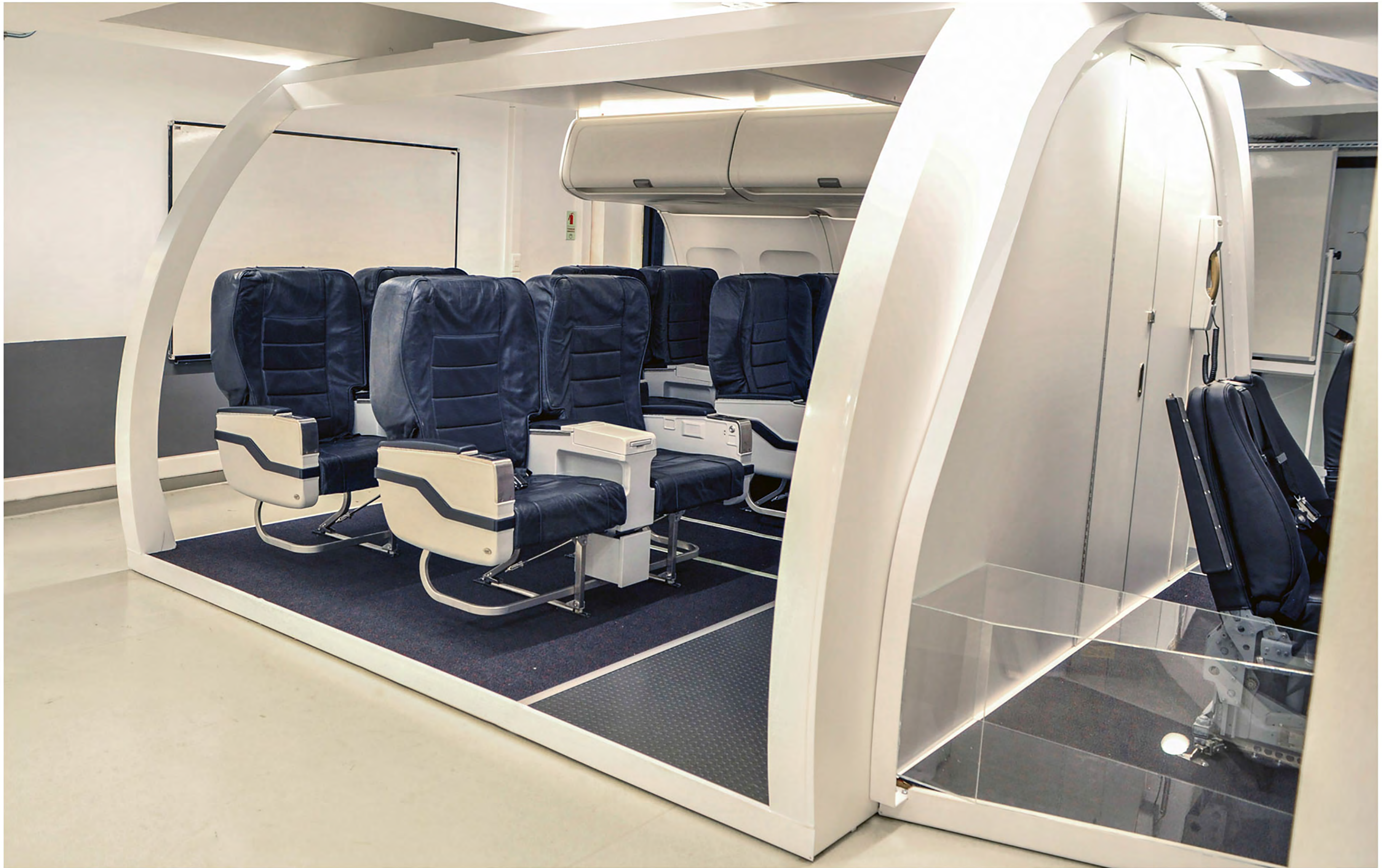
ISTANBUL BILGI UNIVERSITY AIRBUS 320 NARROW BODY TRAINER