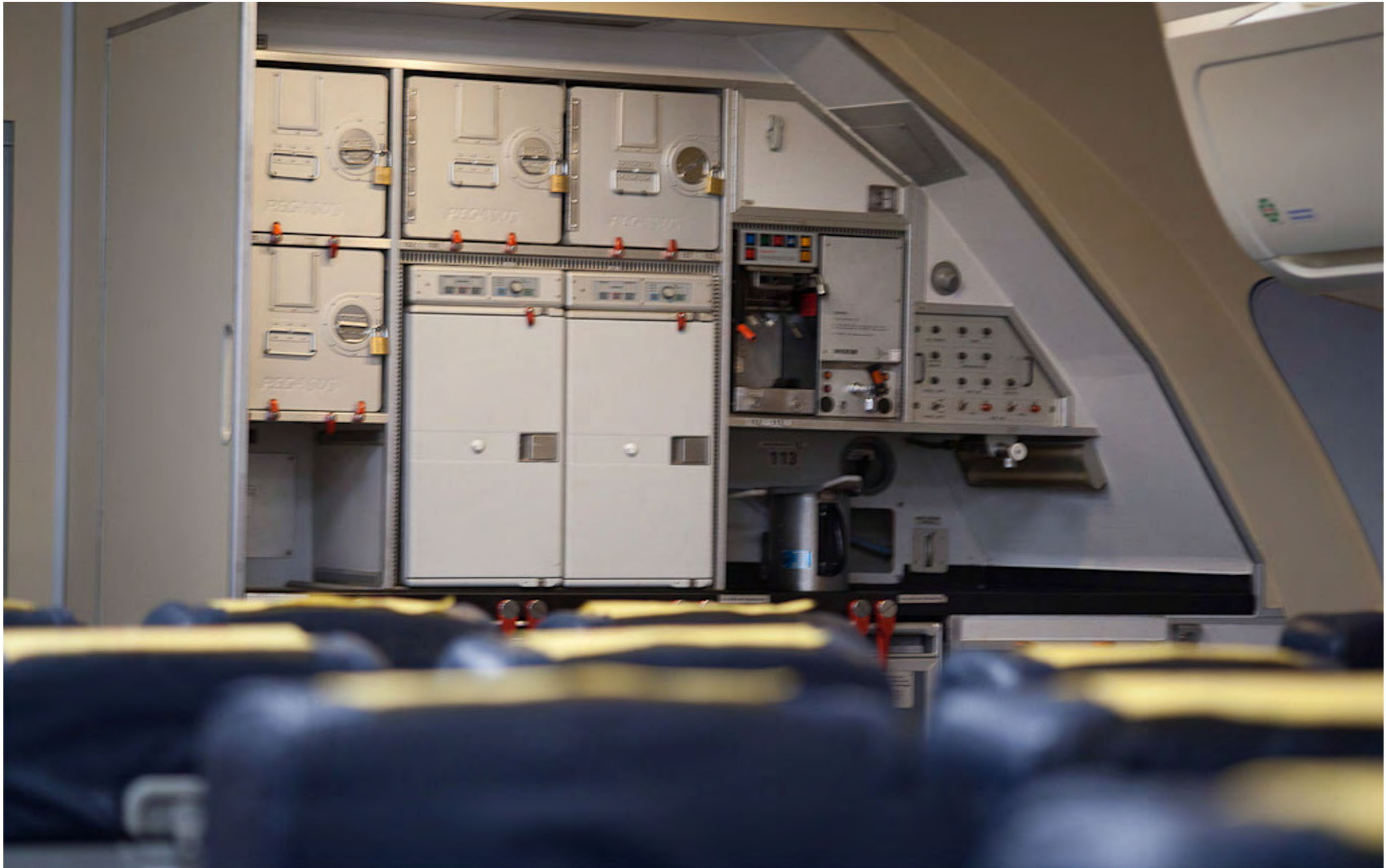
PEGASUS AIRLINES AIRBUS NARROW BODY CABIN SERVICE TRAINER