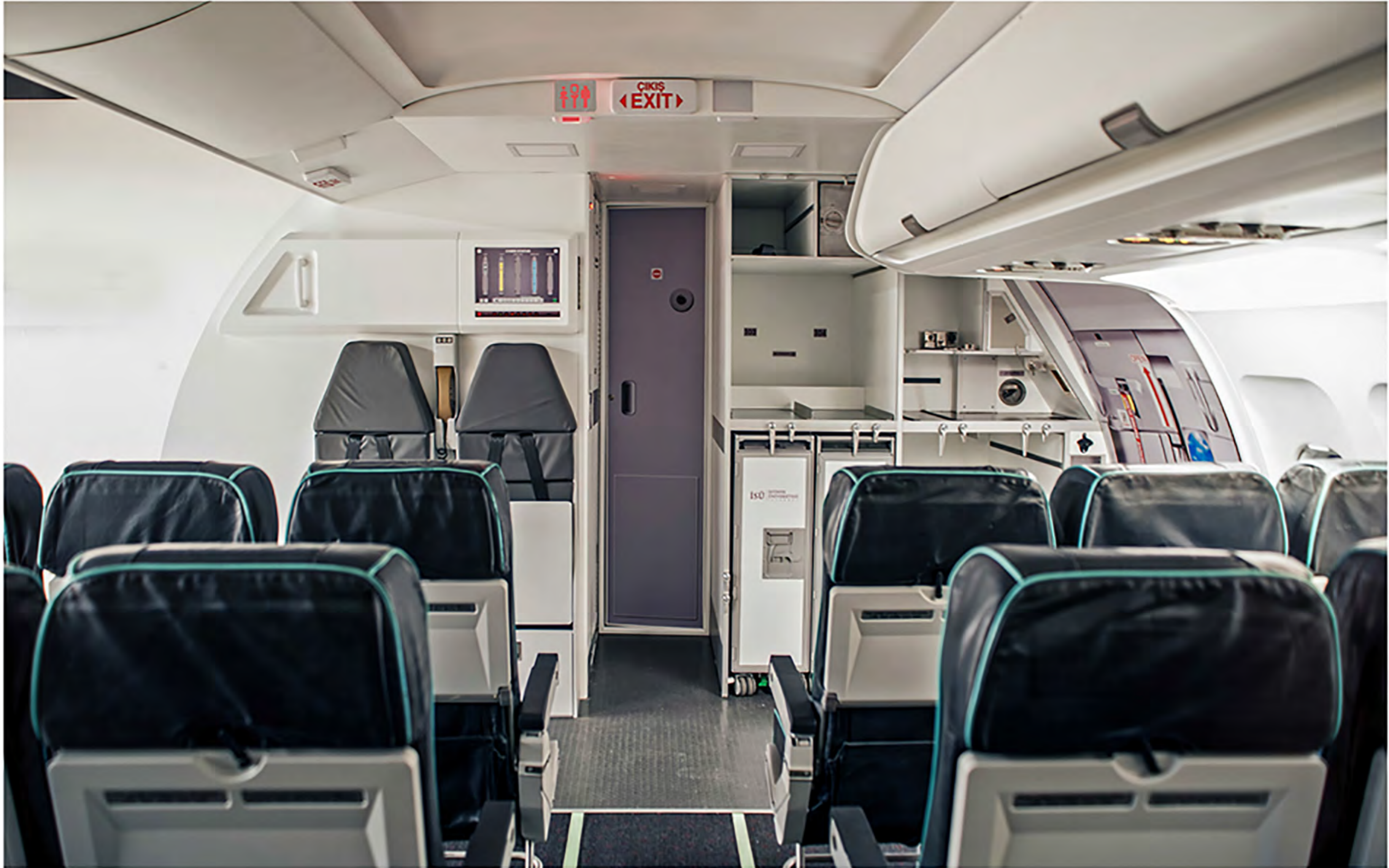
ISTANBUL ISTINYE UNIVERSTY AIRBUS 320 NARROW BODY CABIN SERVICE TRAINER