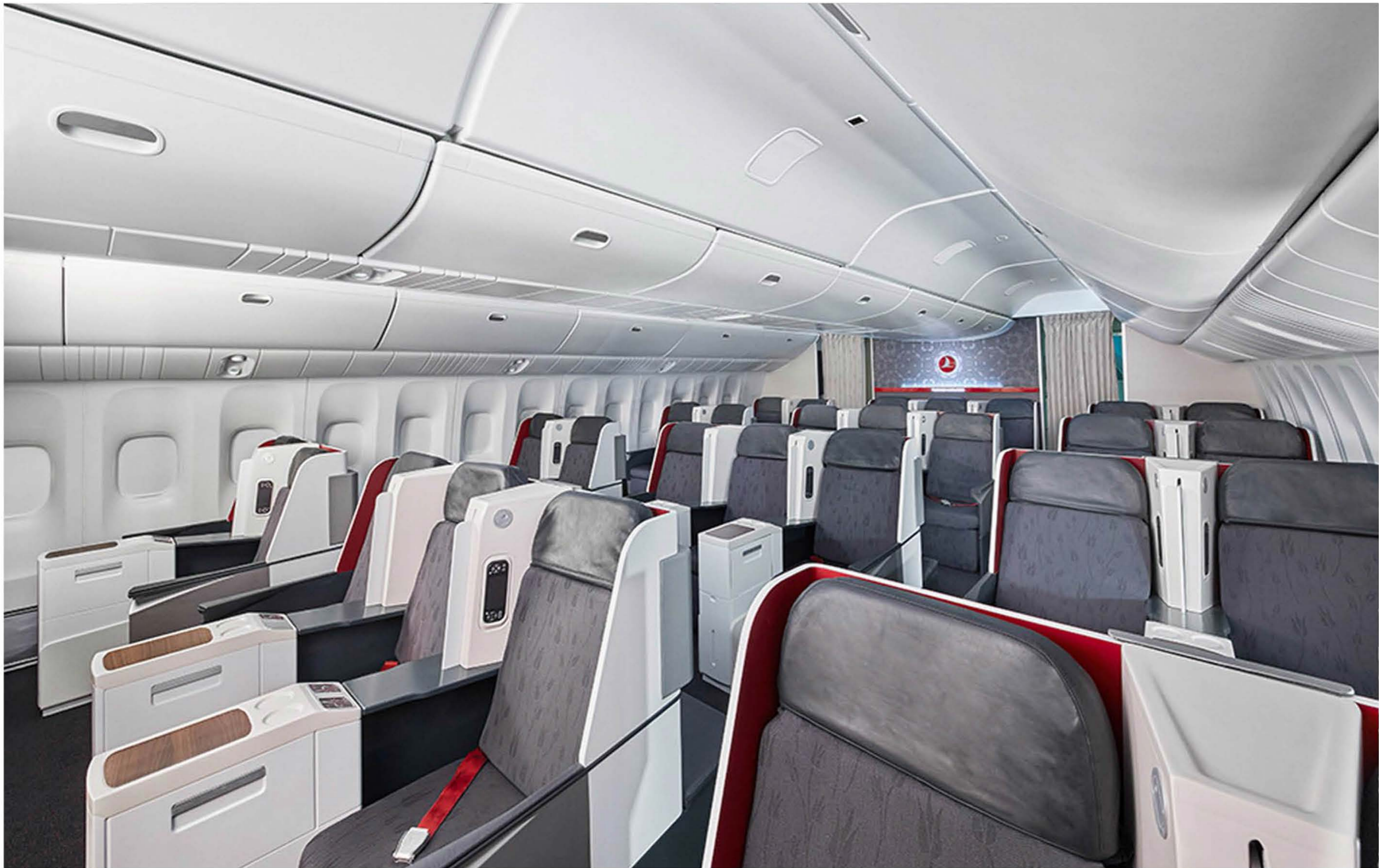
TURKISH AIRLINES BOEING 777 - 300ER MOCK - UP