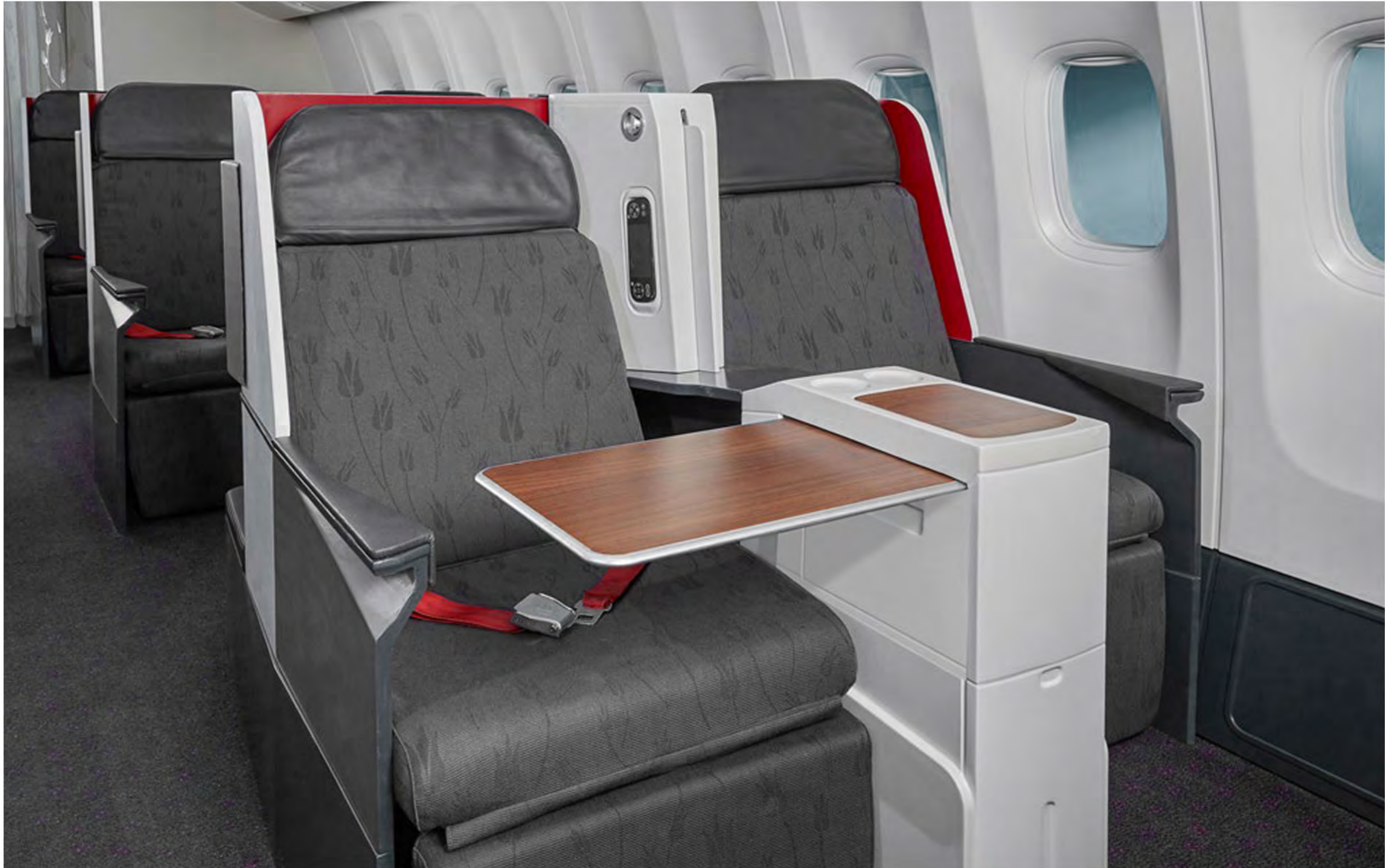
TURKISH AIRLINES BOEING 777 - 300ER MOCK - UP