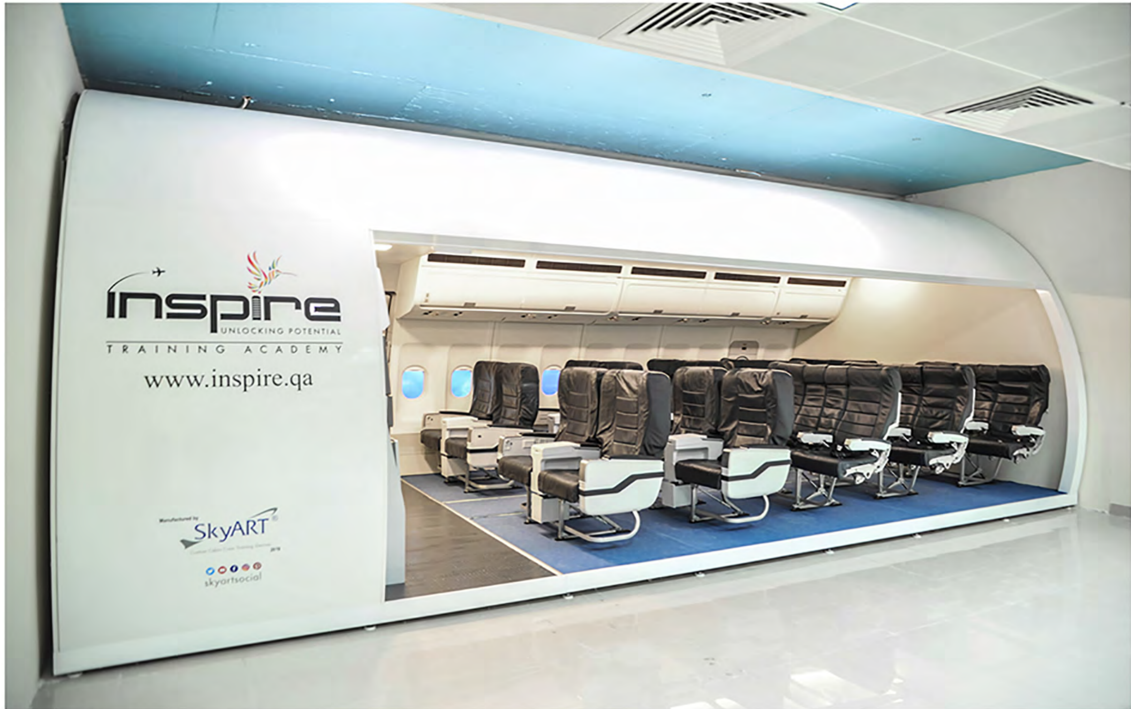
INSPIRE TRAINING ACADEMY AIRBUS NARROW BODY CABIN SERVICE TRAINER