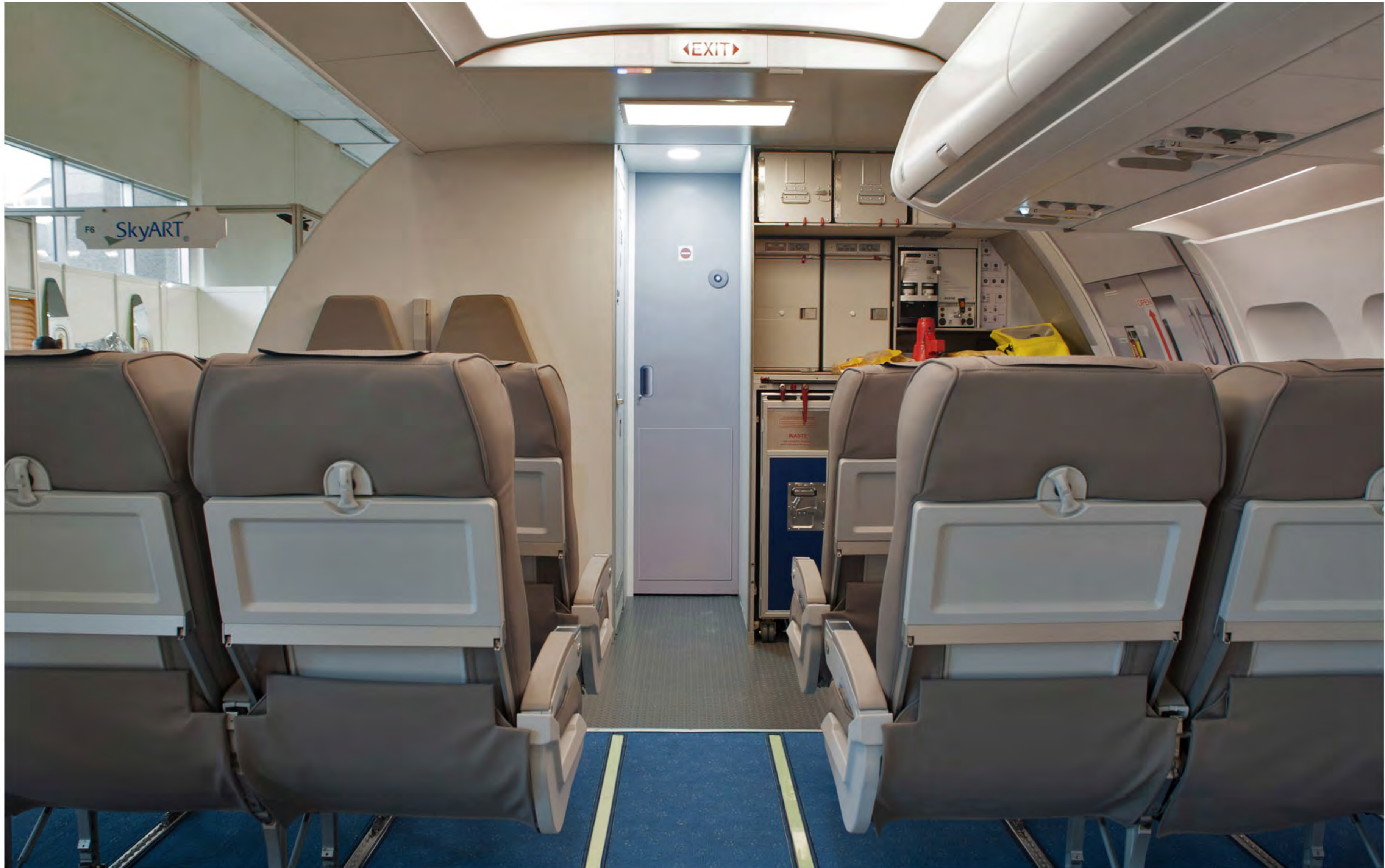
AIRBUS 320 NARROW BODY CABIN SERVICE TRAINER