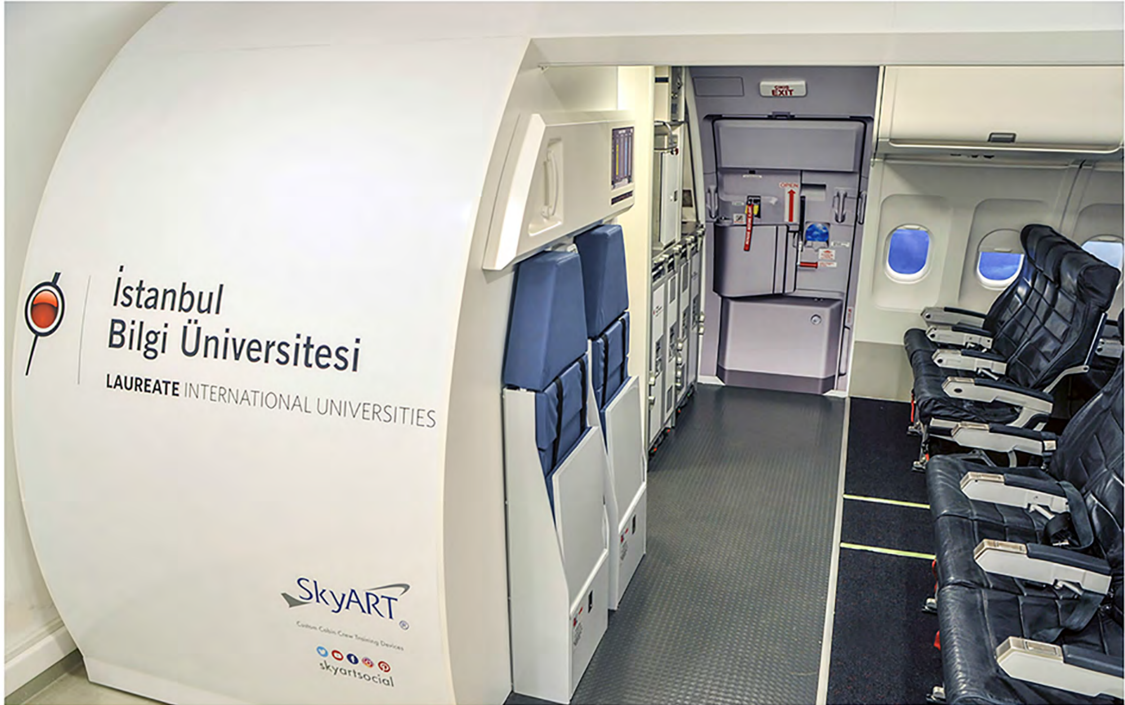
ISTANBUL BILGI UNIVERSITY AIRBUS 320 NARROW BODY TRAINER