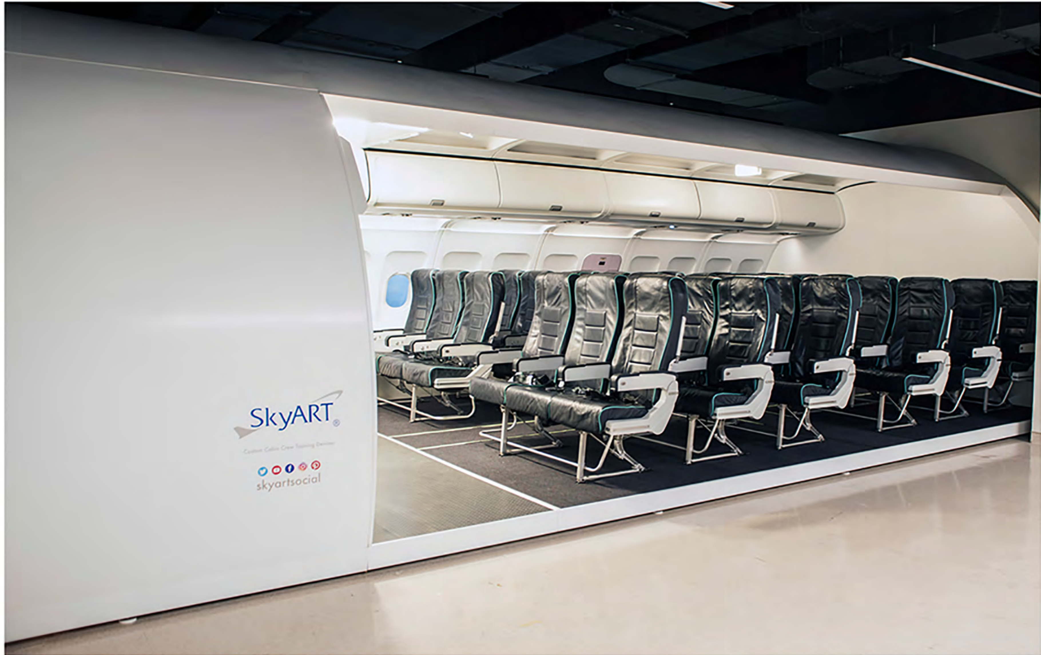
ISTANBUL ISTINYE UNIVERSTY AIRBUS 320 NARROW BODY CABIN SERVICE TRAINER