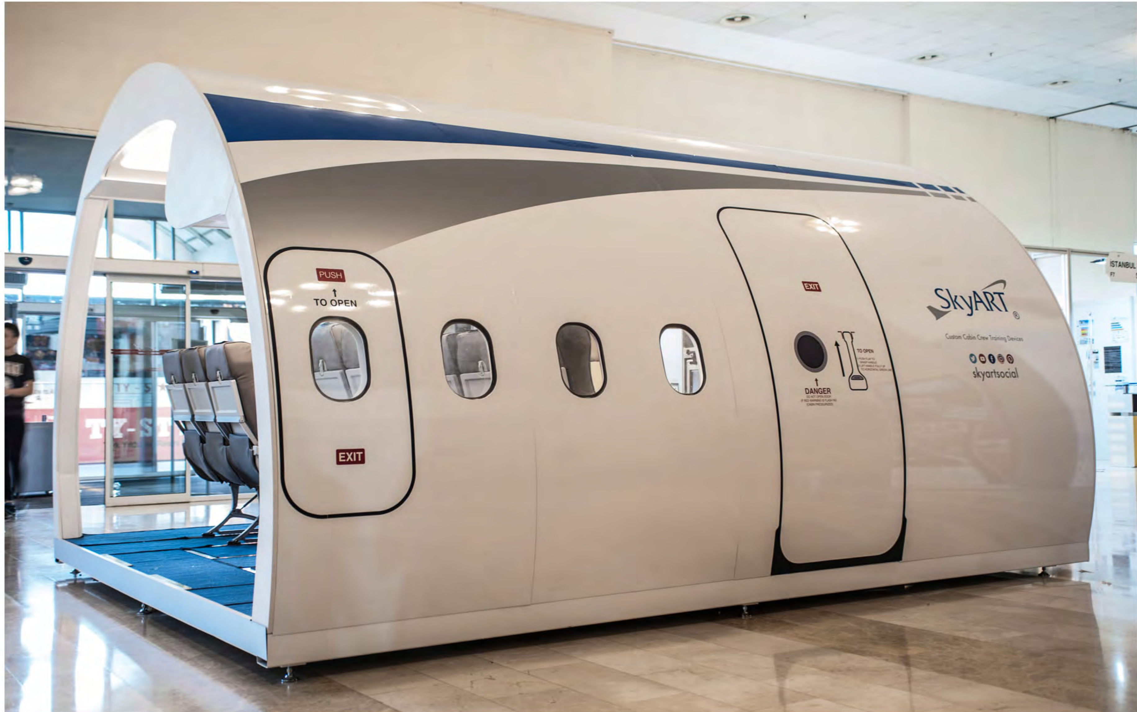
AIRBUS 320 NARROW BODY CABIN SERVICE TRAINER