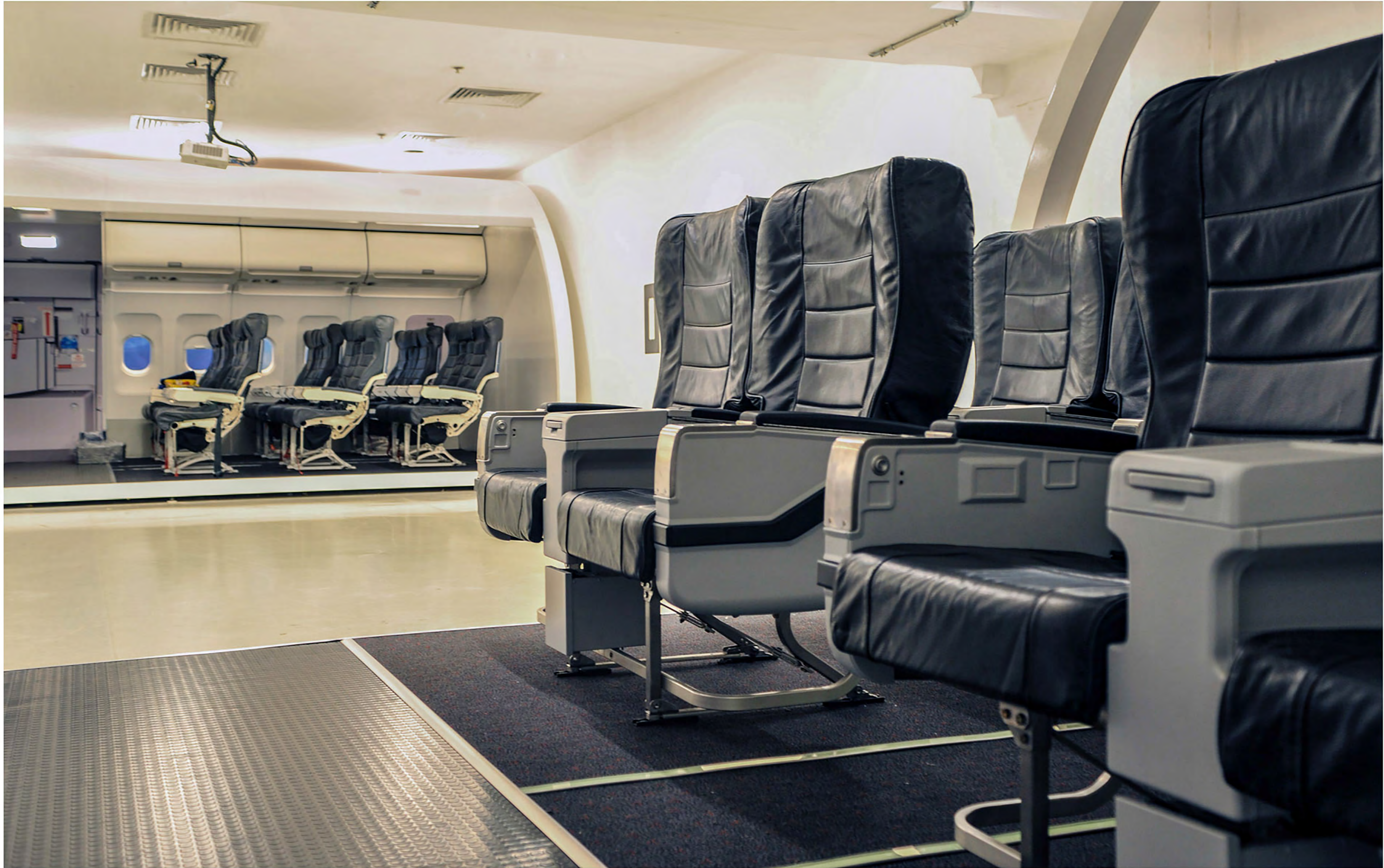
ISTANBUL BILGI UNIVERSITY AIRBUS 320 NARROW BODY TRAINER