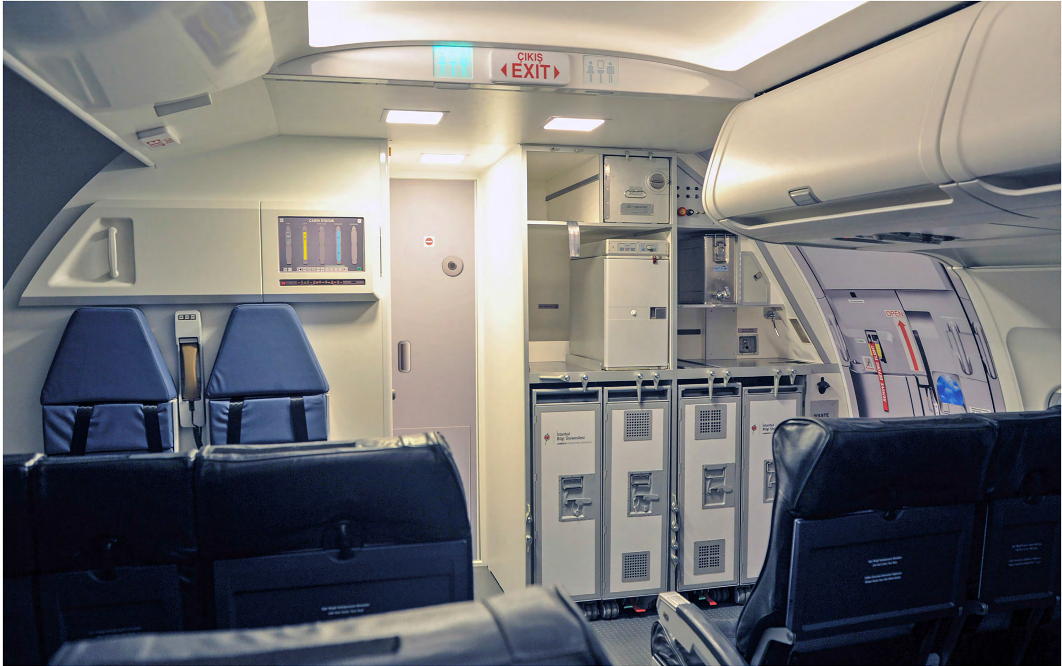
ISTANBUL BILGI UNIVERSITY AIRBUS 320 NARROW BODY TRAINER