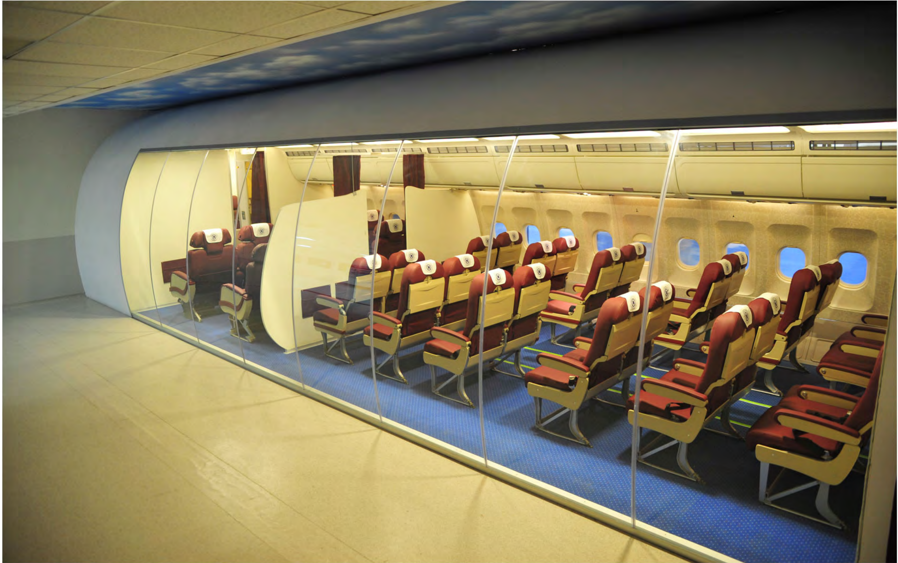
ISTANBUL AYDIN UNIVERSITY AIRBUS NARROW BODY CABIN SERVICE TRAINER