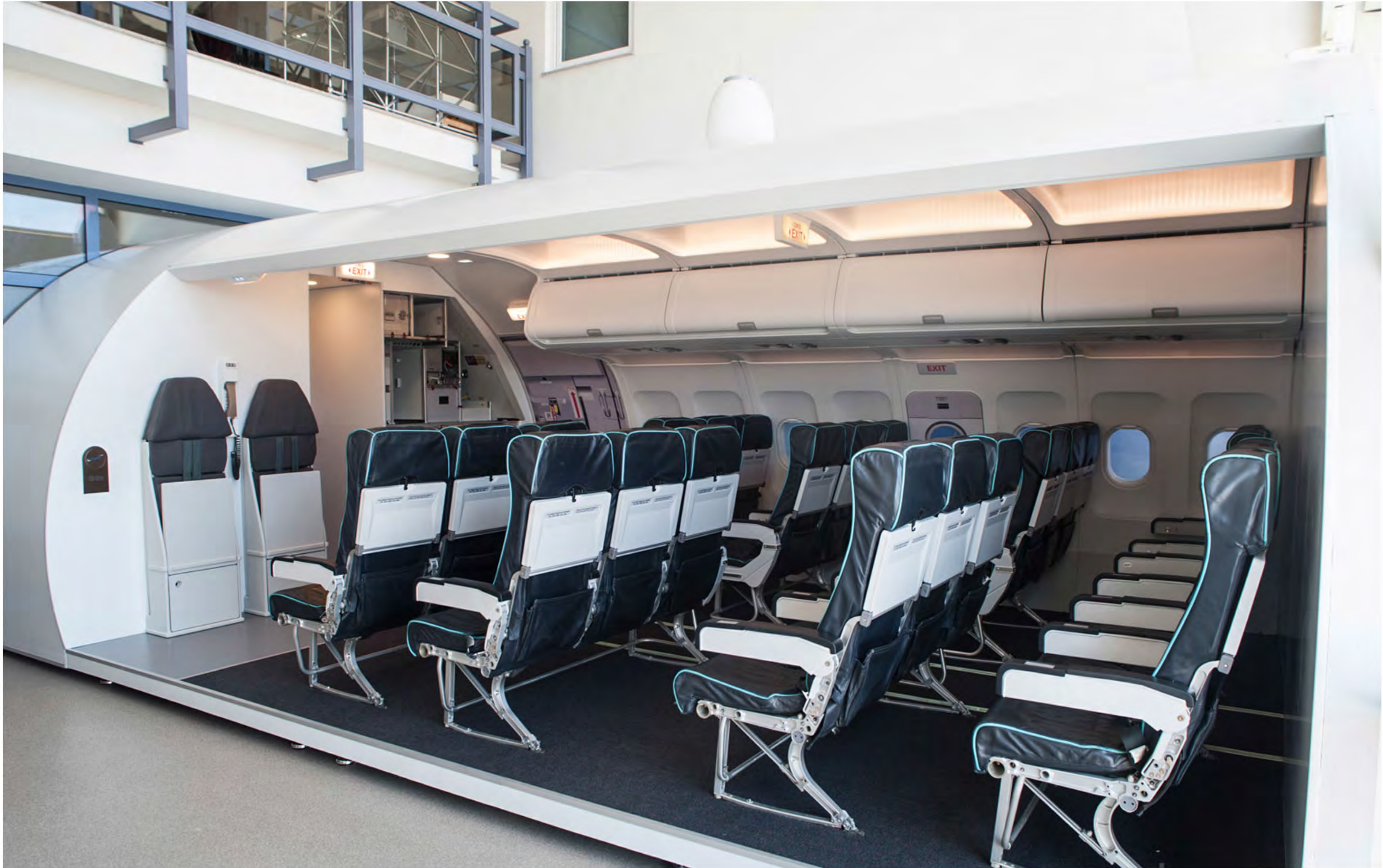
GEDIK UNIVERSITY AIRBUS 320 NARROW BODY CABIN SERVICE TRAINER