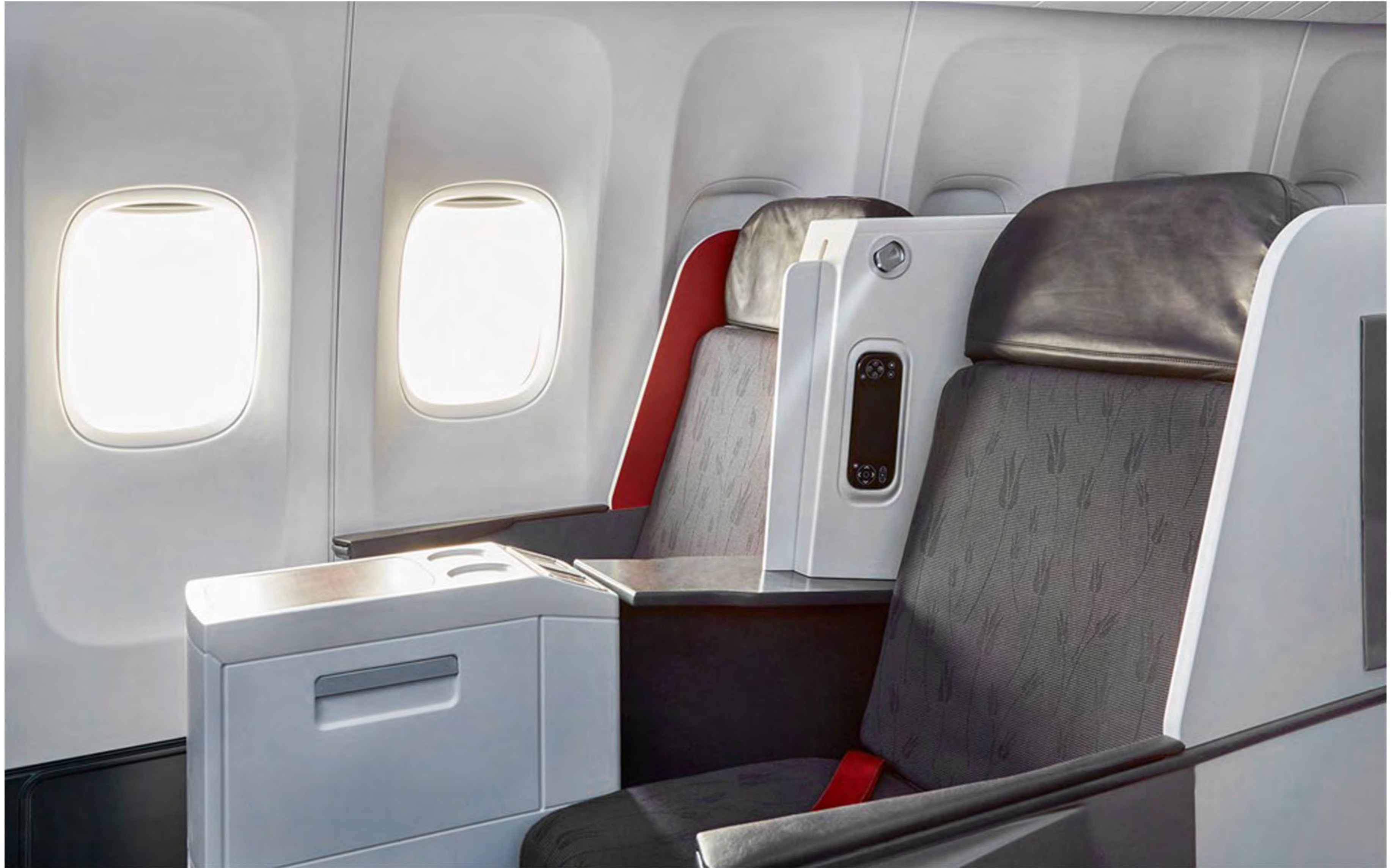
TURKISH AIRLINES BOEING 777 - 300ER MOCK - UP