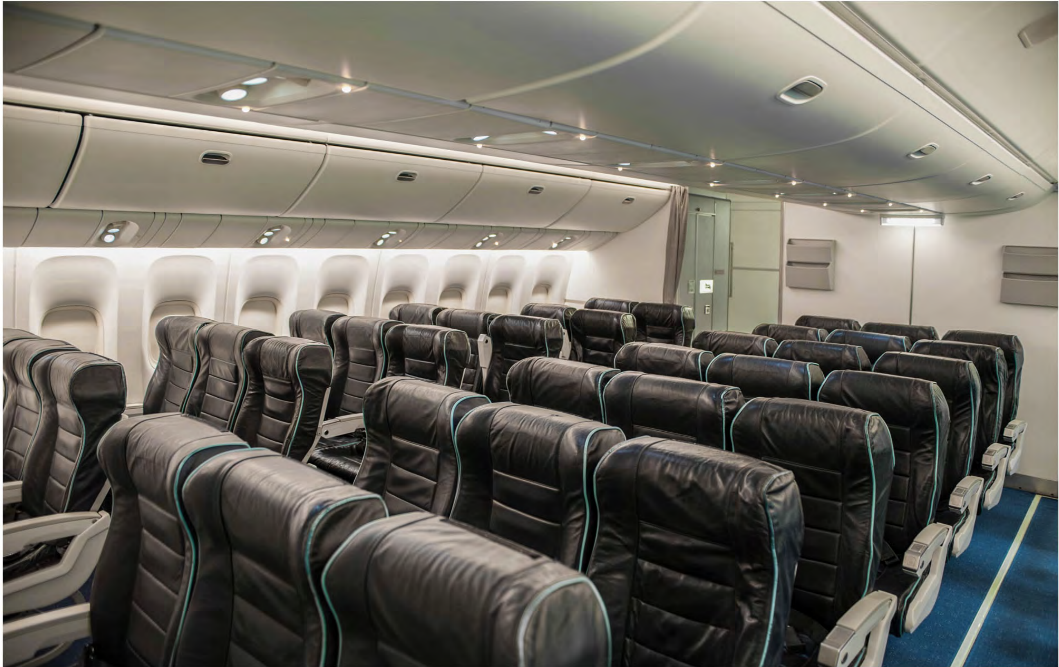
US DEPT. OF STATE & BORDER GUARD SERVICE OF THE REPUBLIC OF KAZAKHSTAN BOEING 777 WIDE BODY TRAINER