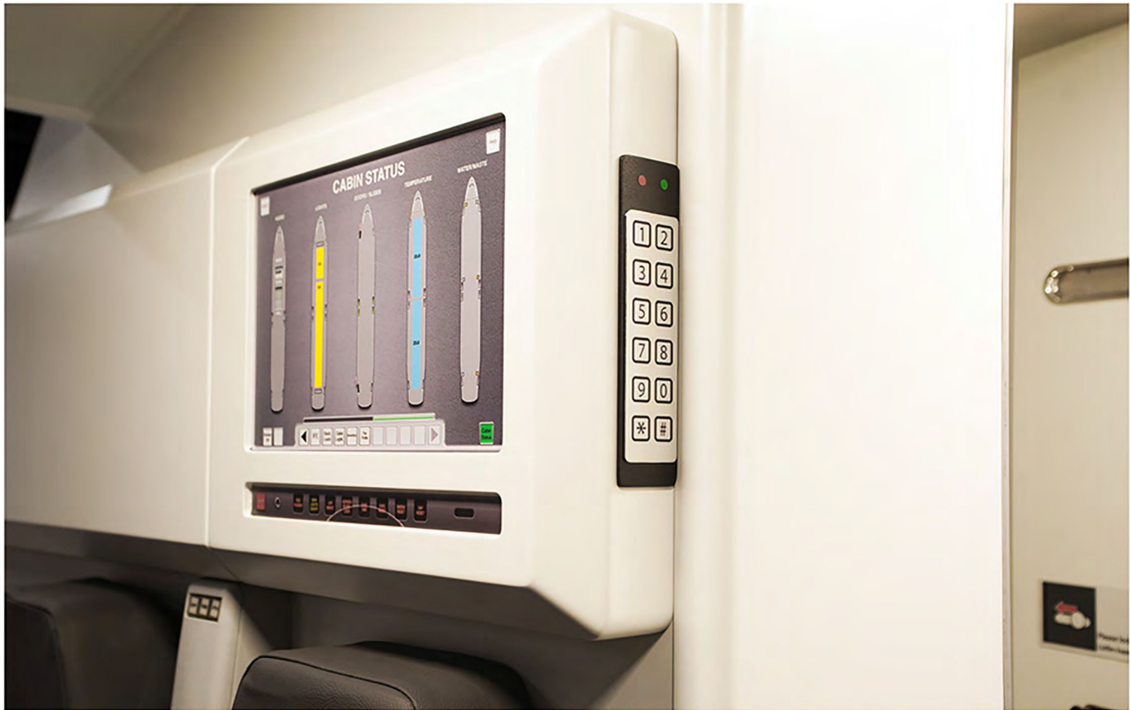
ISTANBUL ISTINYE UNIVERSTY AIRBUS 320 NARROW BODY CABIN SERVICE TRAINER