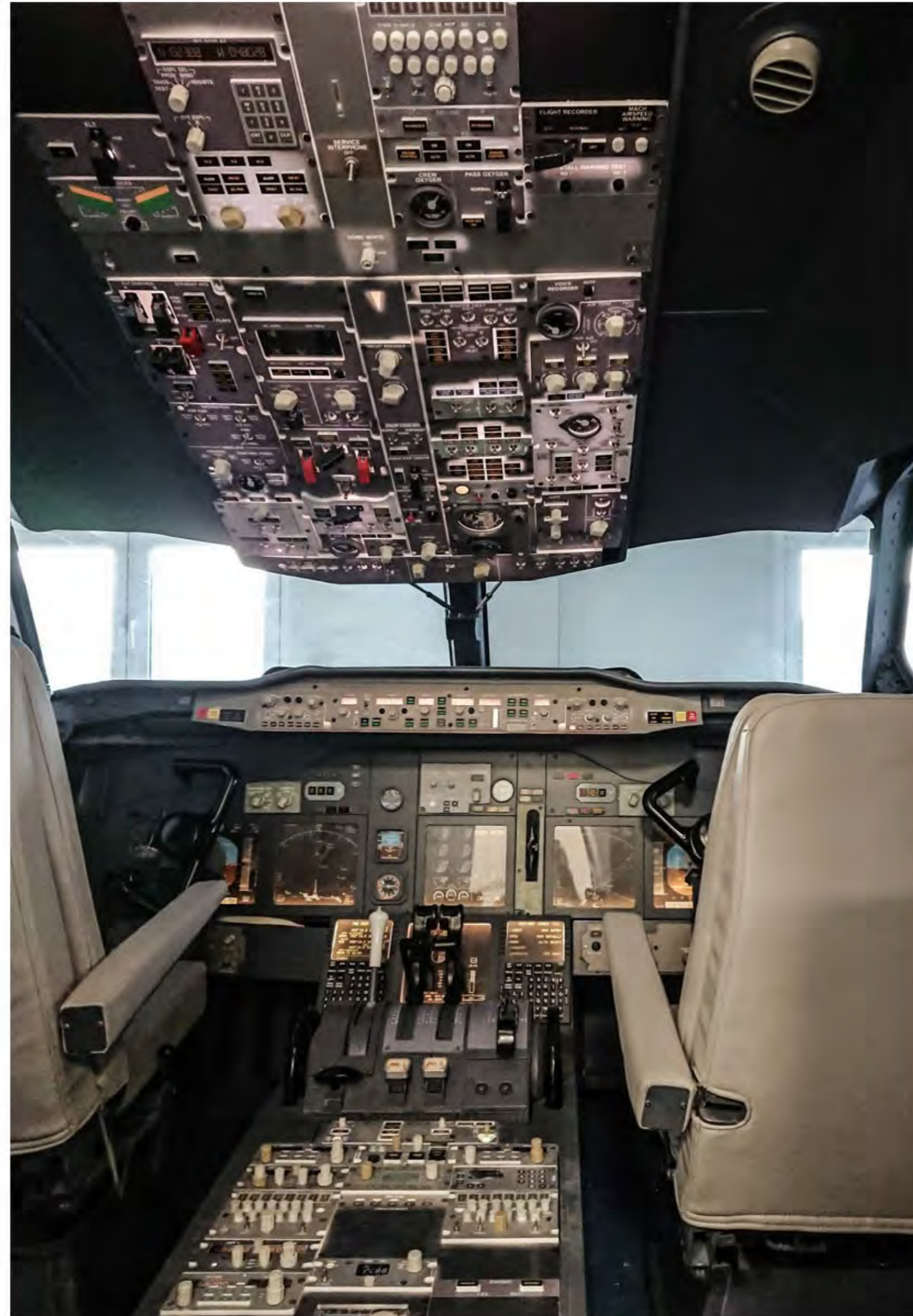
US DEPT. OF STATE & BORDER GUARD SERVICE OF THE REPUBLIC OF KAZAKHSTAN BOEING 777 WIDE BODY TRAINER