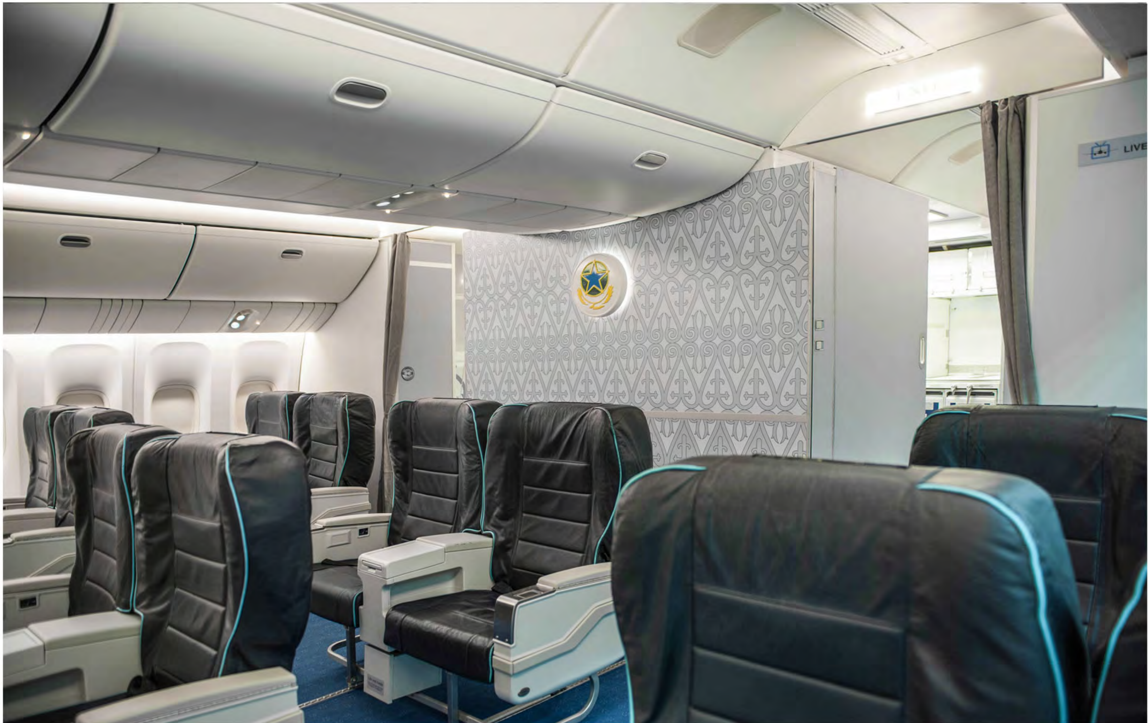
US DEPT. OF STATE & BORDER GUARD SERVICE OF THE REPUBLIC OF KAZAKHSTAN BOEING 777 WIDE BODY TRAINER