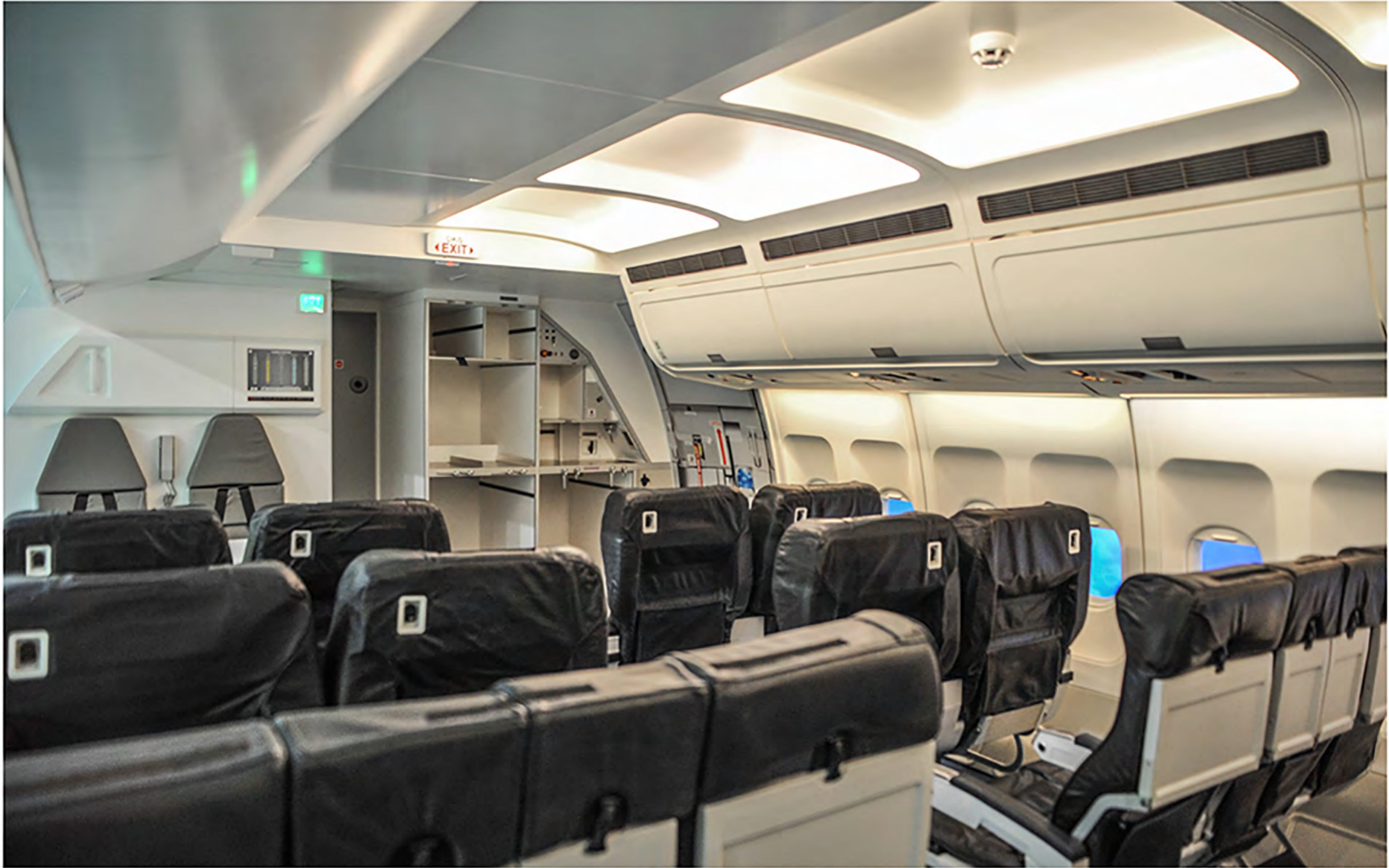
INSPIRE TRAINING ACADEMY AIRBUS NARROW BODY CABIN SERVICE TRAINER