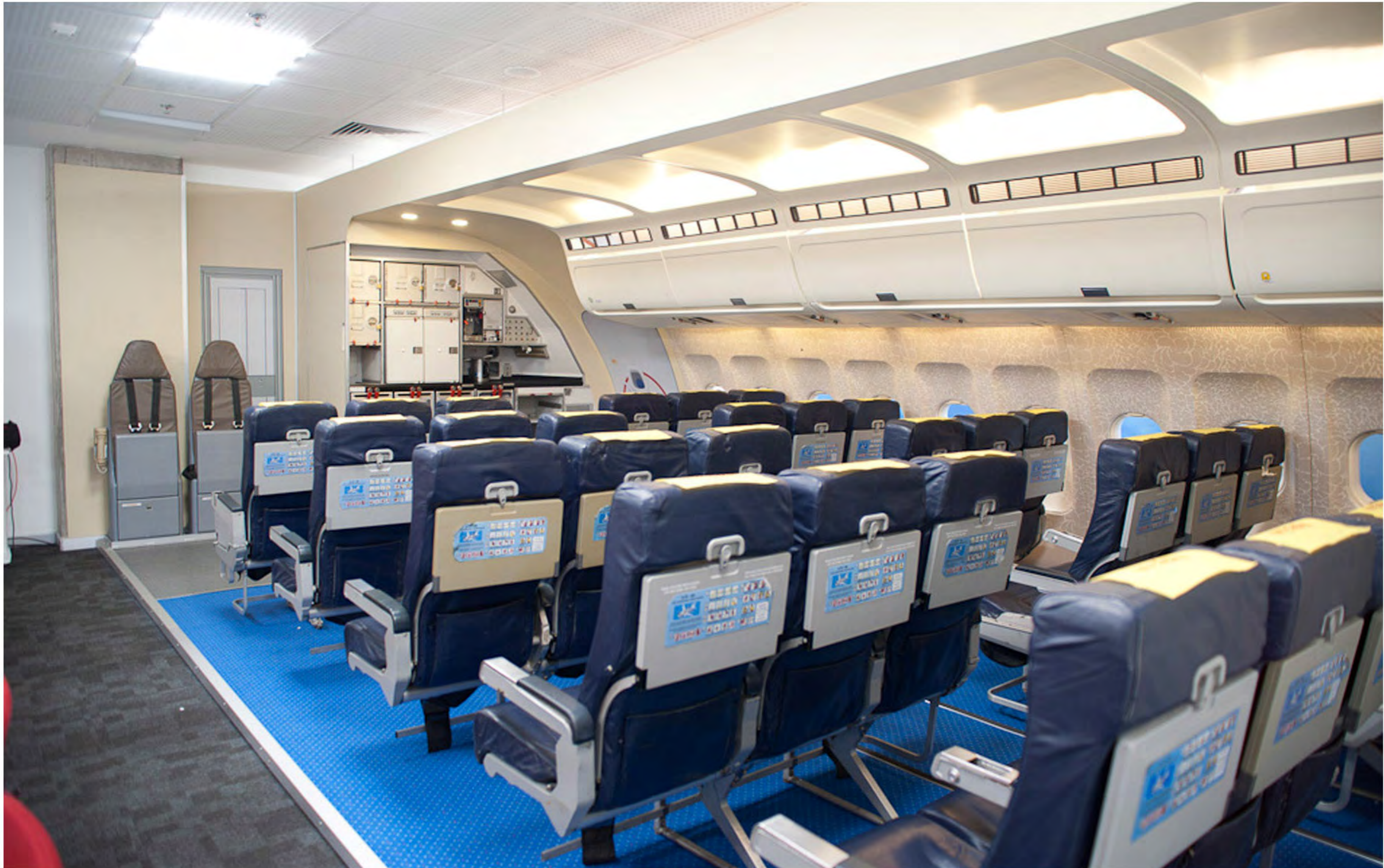
PEGASUS AIRLINES AIRBUS NARROW BODY CABIN SERVICE TRAINER