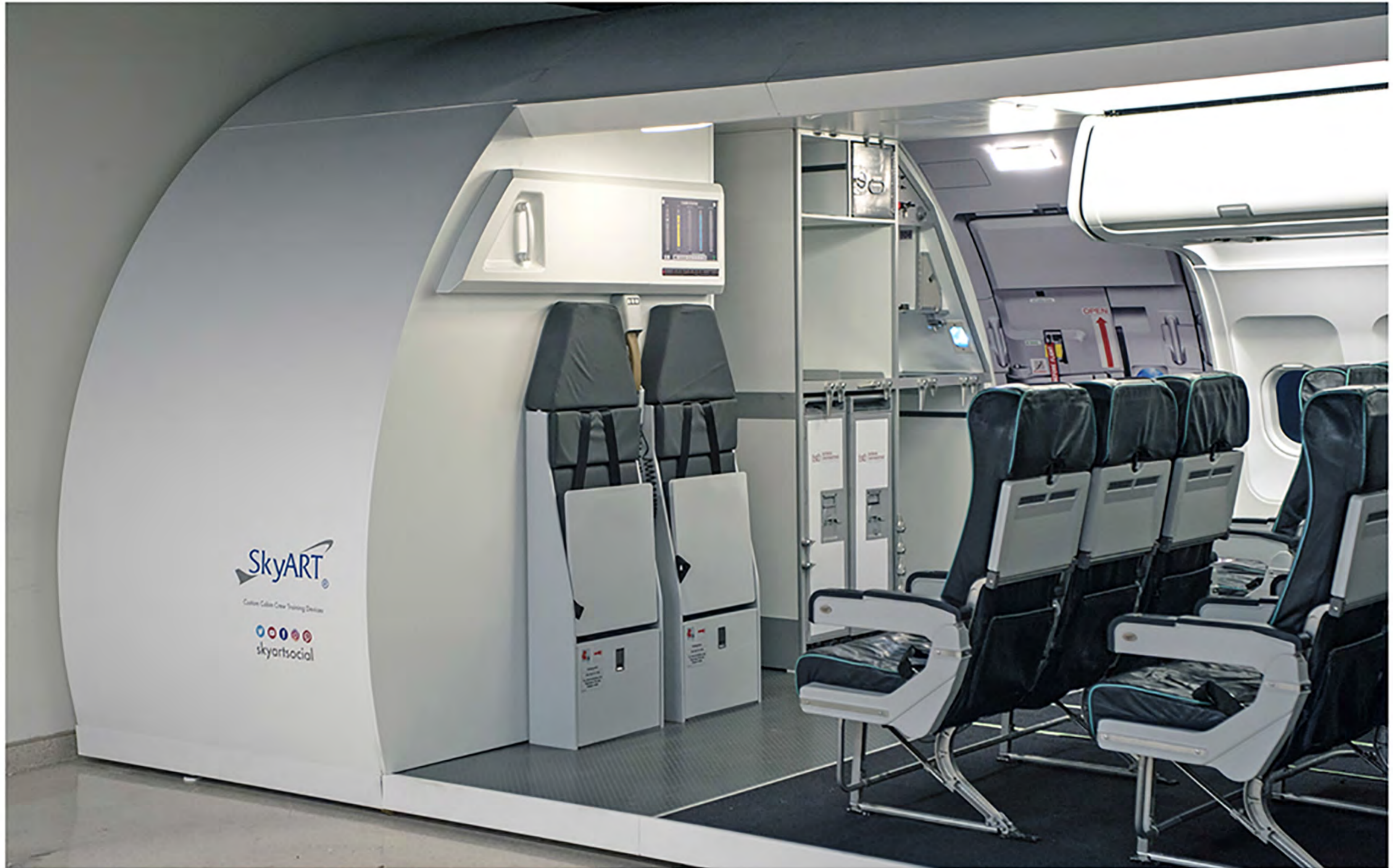
ISTANBUL ISTINYE UNIVERSTY AIRBUS 320 NARROW BODY CABIN SERVICE TRAINER